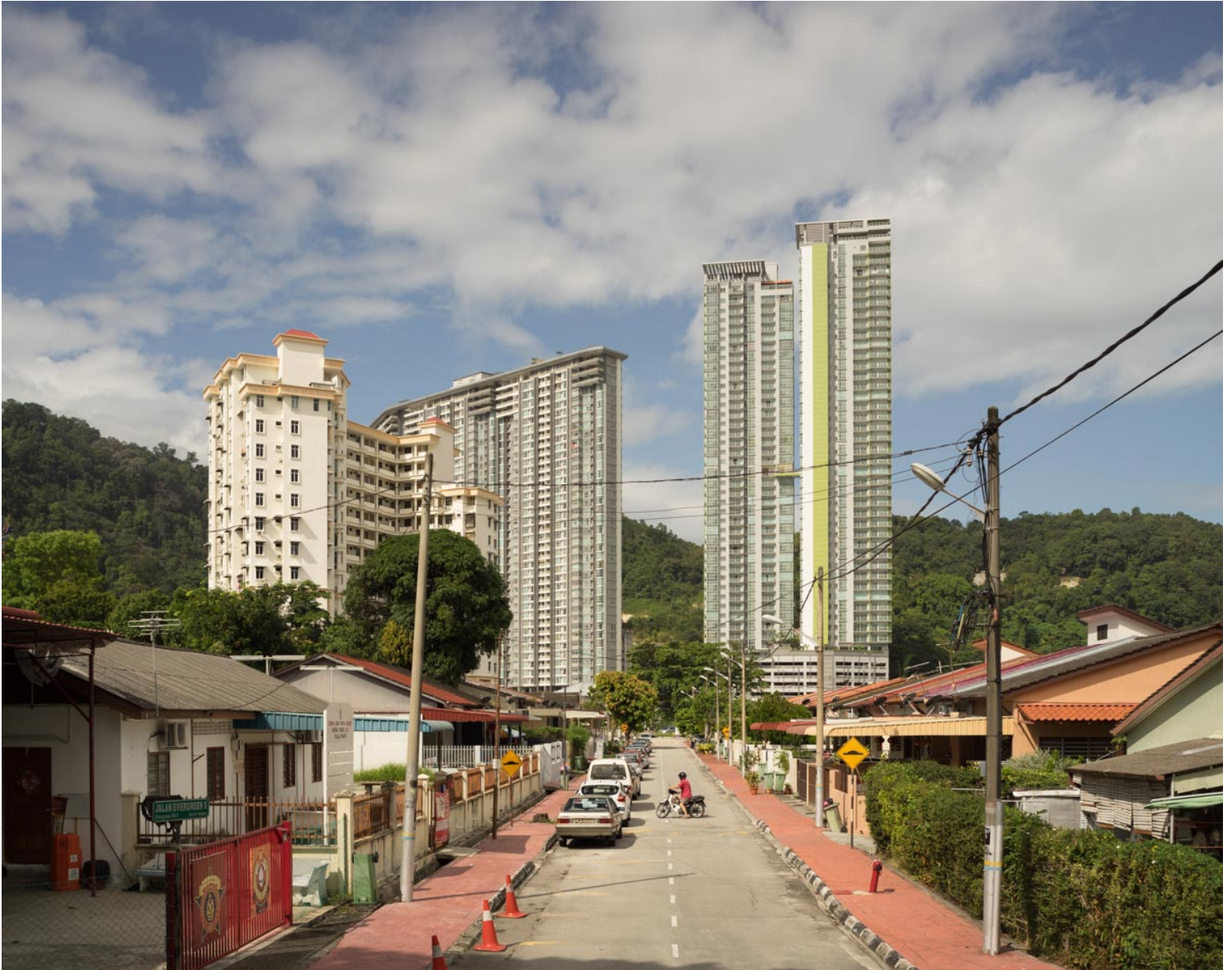
Blue Mountain, Penang Island

Penang Island, MY https://urbannext.net/penang-island-my/