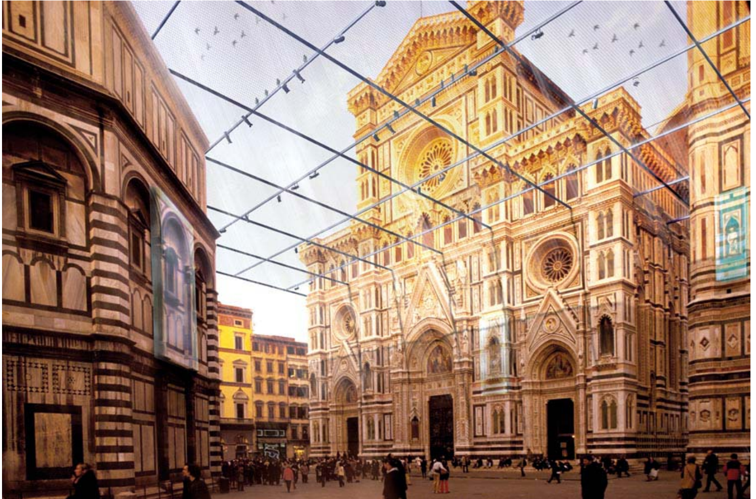
"Florence, Italy" from Museums of the City (2011), David Gissen (rendered by Victor Hadjikyriacou). Image background: Maremagnum, Getty Images .

Museums of the City https://urbannext.net/museums-of-the-city/