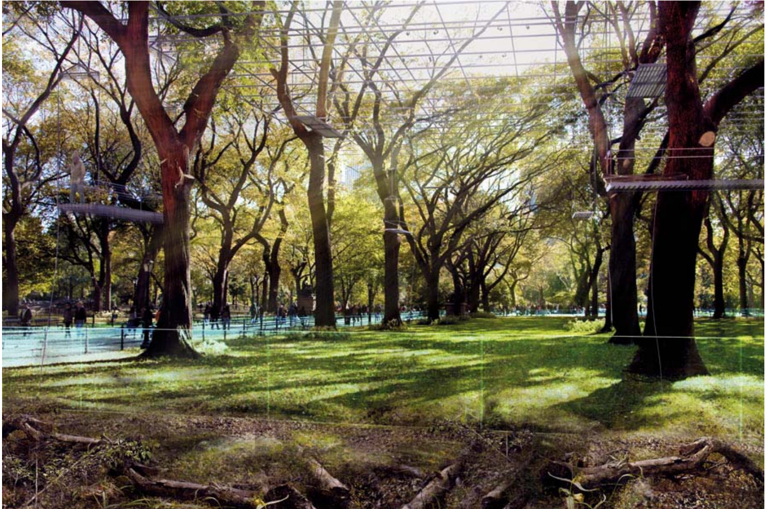
“Central Park, New York City” from Museums of the City (2011), David Gissen (rendered by Victor Hadjikyriacou).

Museums of the City https://urbannext.net/museums-of-the-city/