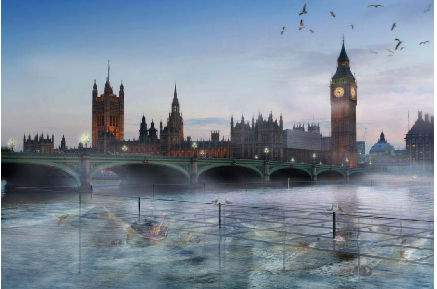
“Thames River, London” from Museums of the City (2011), David Gissen (rendered by Victor Hadjikyriacou).

Museums of the City https://urbannext.net/museums-of-the-city/