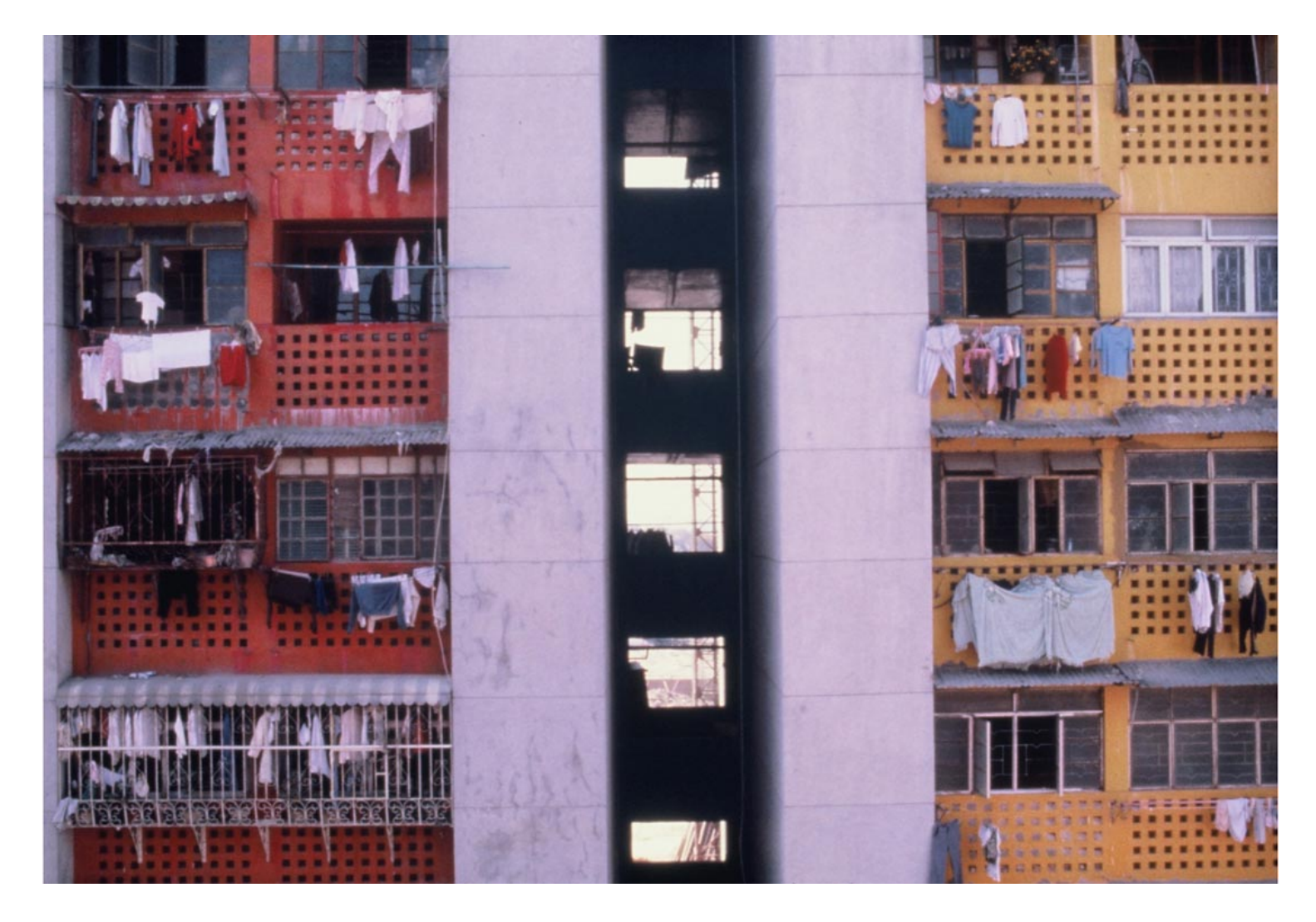
STDM building, 1984