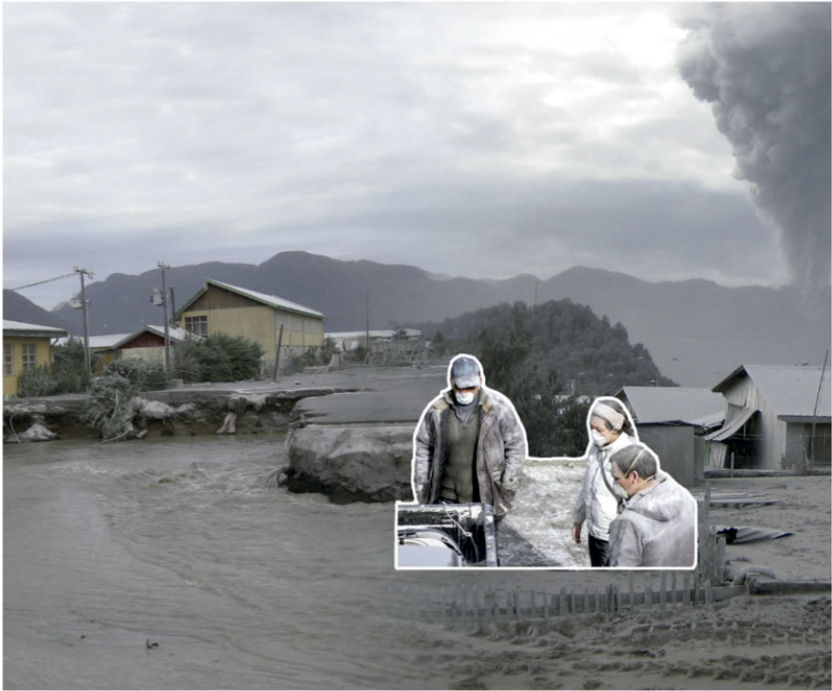
In the process of surveying a new site for