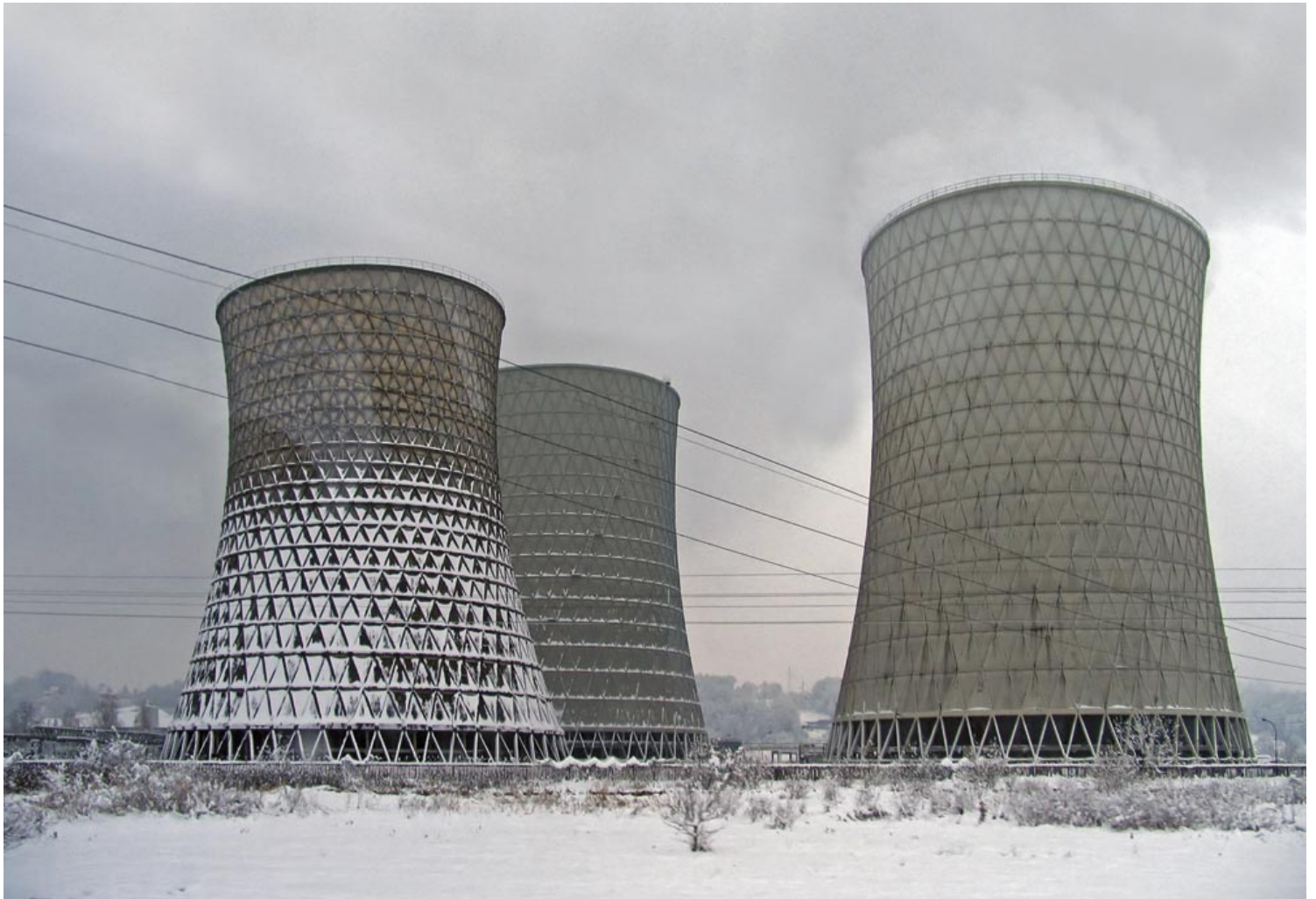
Thermoelectric Power Plant Cooling Towers, Tuzla, Bosnia and Herzegovina, David Kitching (2008)

The poverty of much urbanist thought can be traced to a persistent fallacy: that the city, or Metropolis, expresses itself preeminently in its physical form and that it is amenable to analysis and intervention as a finite concrete object alone. The city, however, is not this but rather a perpetually organizing field of forces in movement, each city a specific and unique combination of historical modalities in dynamic composition.