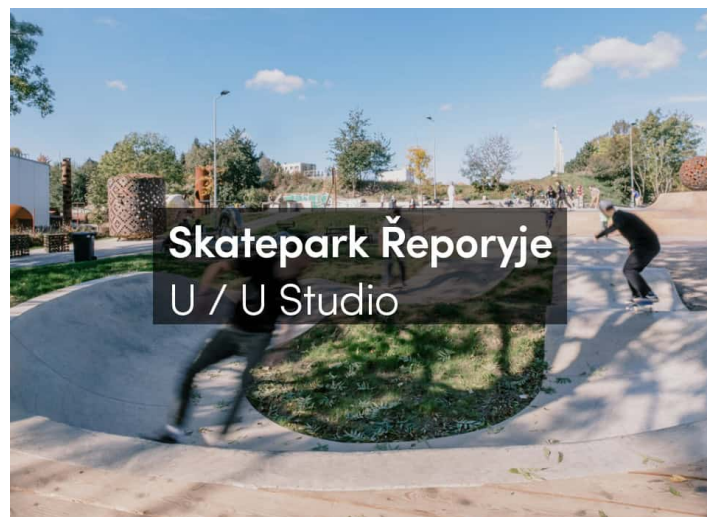
Skatepark Řeporyje U / U Studio