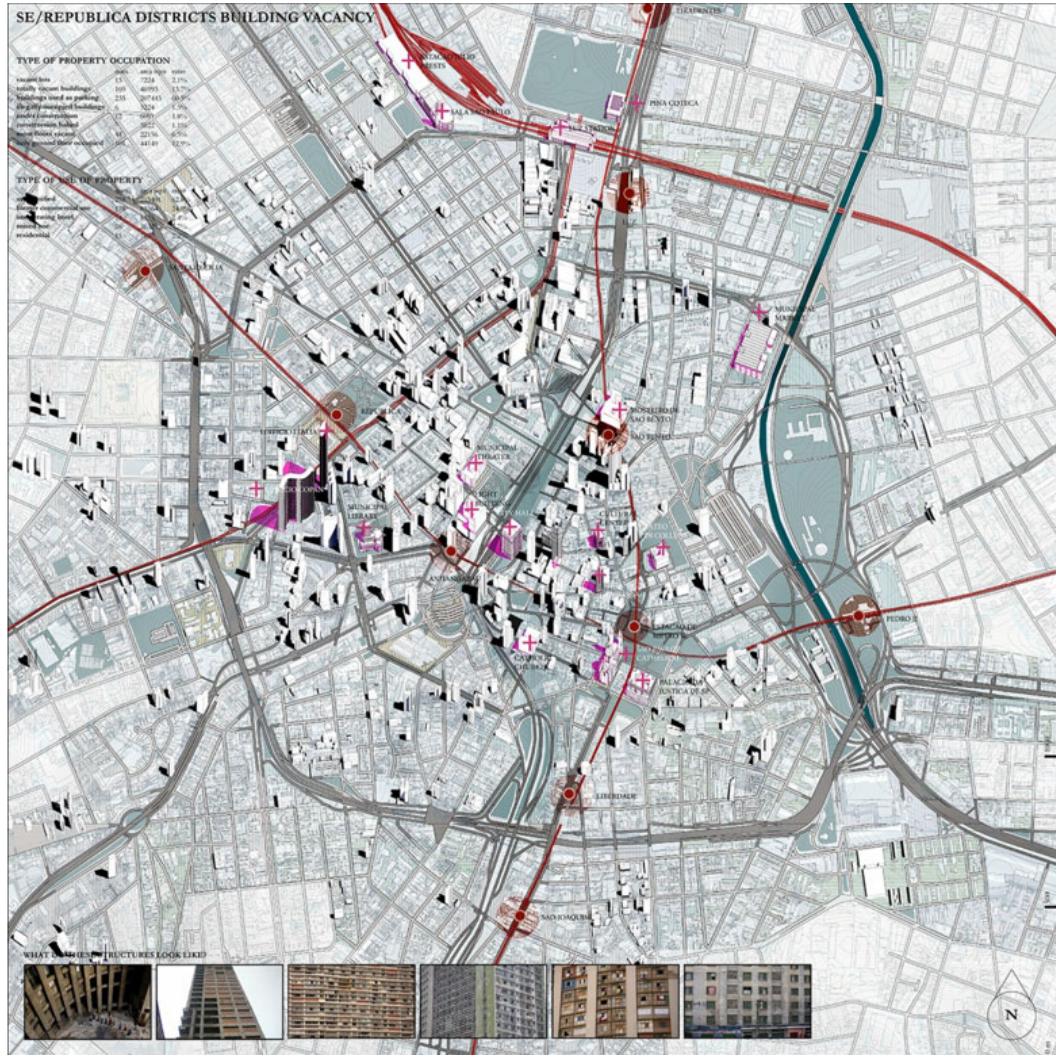
Sé/República Districts Building Vacancy (Helena Rong, 2017)

Potentials for Surgical Urbanism https://urbannext.net/potentials-for-surgical-urbanism/