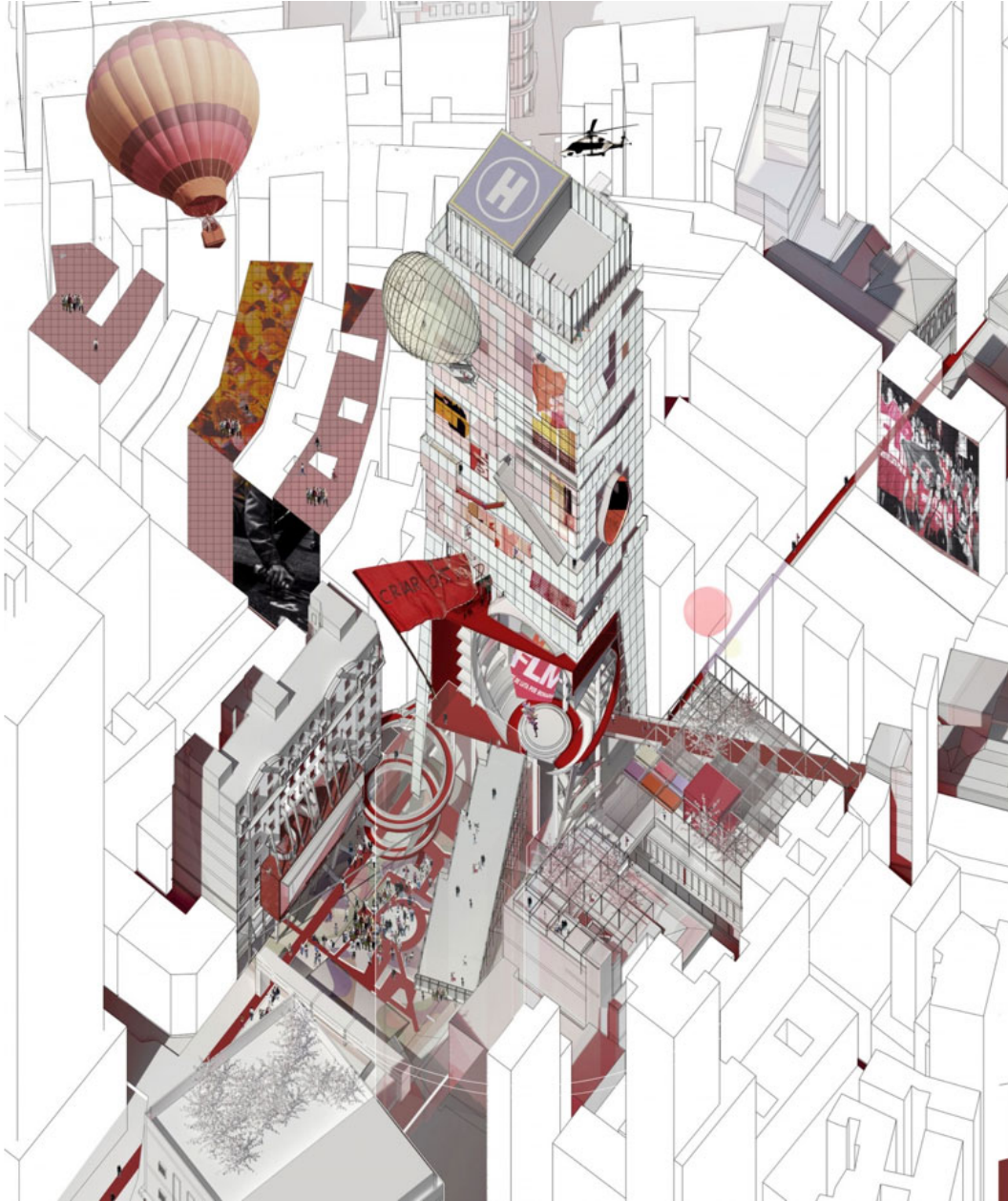
Starting a Protest visionary scenario after 10 years of development (Helena Rong, 2017)

Potentials for Surgical Urbanism https://urbannext.net/potentials-for-surgical-urbanism/