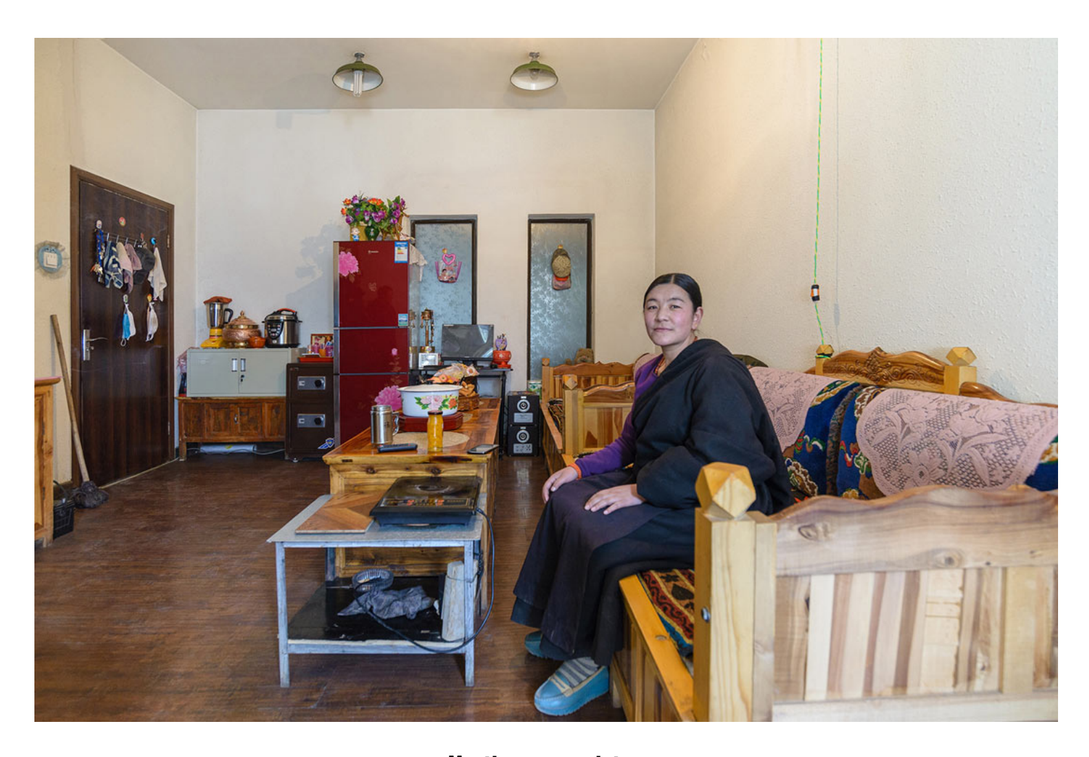
Meeting room, winter.

Jianamani Visitor Center: Vernacular Architecture in Traditional Stone Masonry Style https://urbannext.net/jianamani-visitor-center/