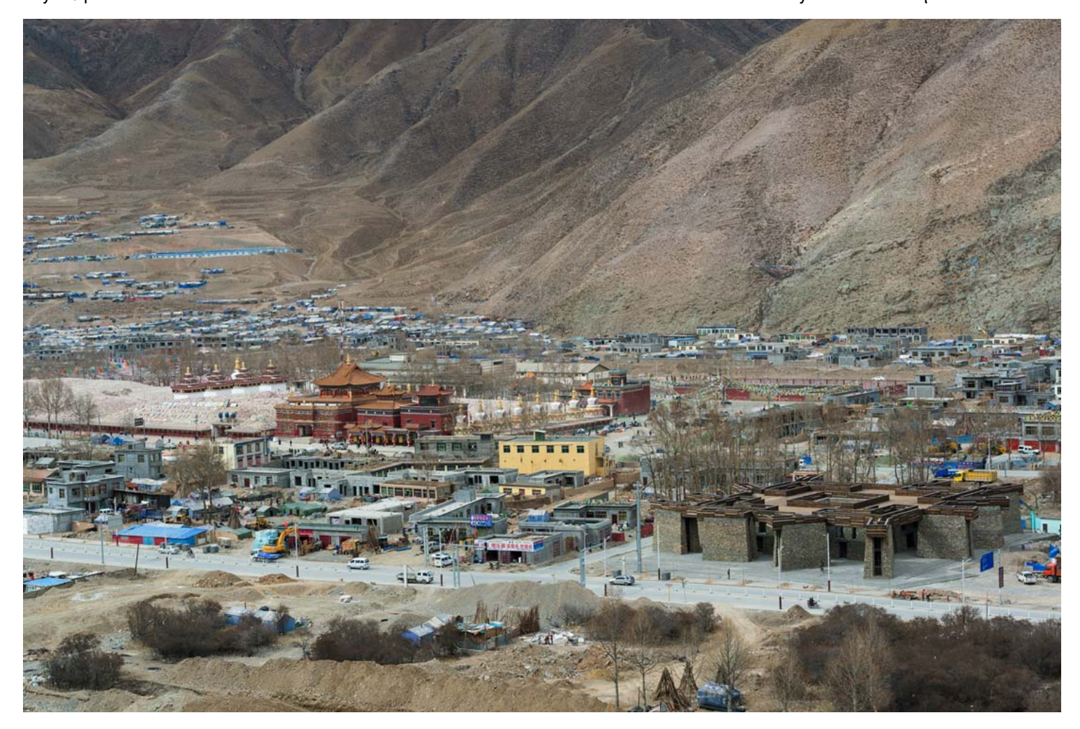
Site view including Jianamani and Jianamani Visitor Center.

Jianamani Visitor Center is a public visitor and community centre on historical Tibetan Buddhist religious site, which includes a local post office, clinic, public toilets, and research archive. The building, with a simple geometry and vernacular architecture in traditional stone masonry style, presents a roof terrace and observation decks made of wood and recycled earthquake debris.