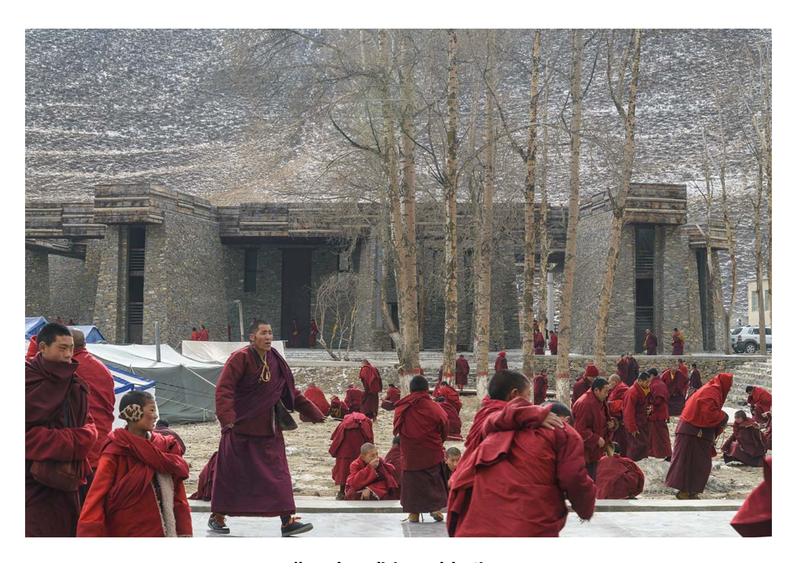
November religious celebration.

Jianamani Visitor Center: Vernacular Architecture in Traditional Stone Masonry Style https://urbannext.net/jianamani-visitor-center/