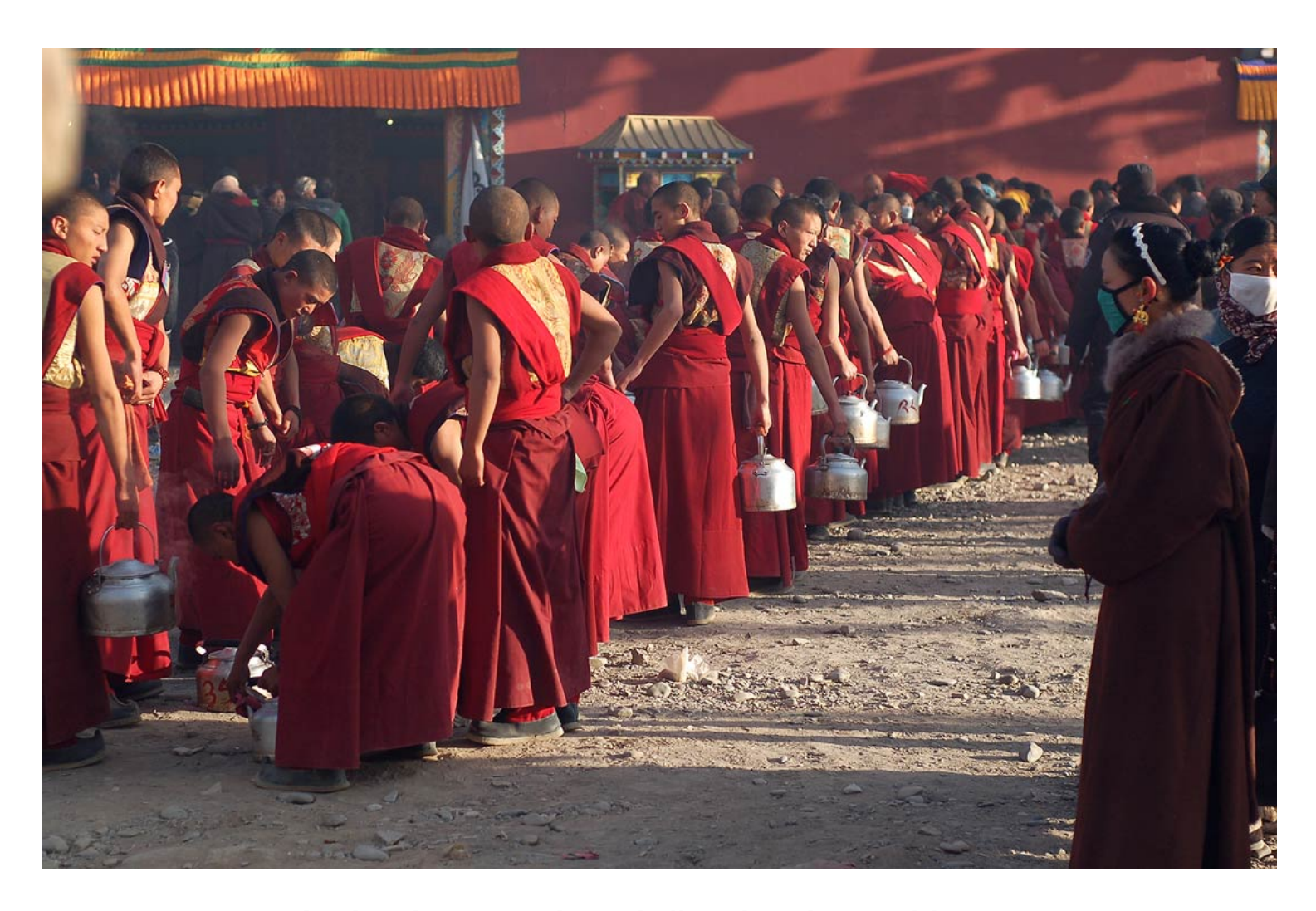
Local monks servicing during the November religious celebration.

Jianamani Visitor Center: Vernacular Architecture in Traditional Stone Masonry Style https://urbannext.net/jianamani-visitor-center/