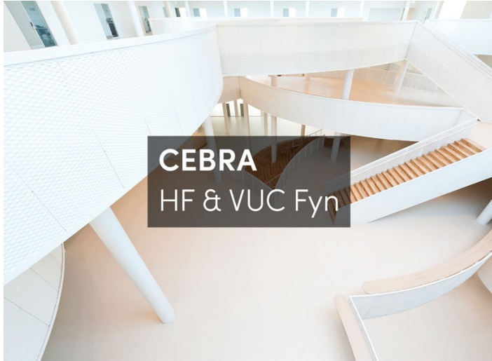
CEBRA HF & VUC Fyn