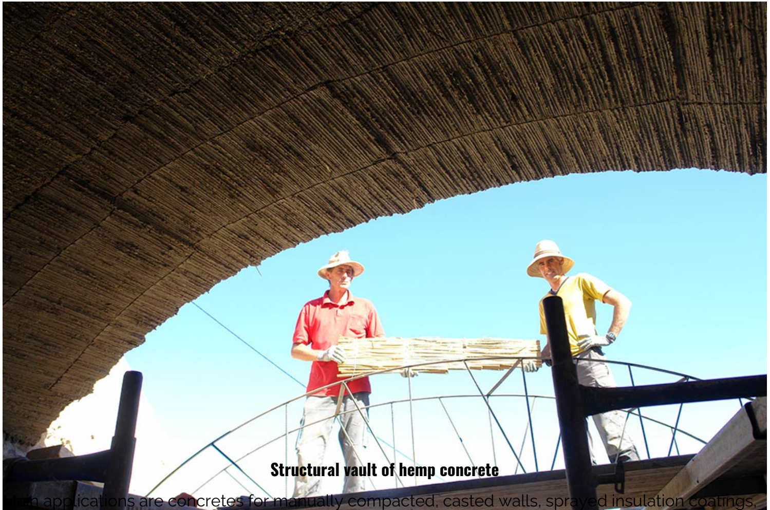
Structural vault of hemp concrete

Common applications are concretes for manually compacted, casted walls, sprayed insulation coatings, external and internal plasters, premade blocks and panels for non load-bearing or load-bearing applications, floor slabs, slabs and roof insulation, including structural applications like vaults and cupolas. Densities of this concretes start with 200-250 kg/m 3 (sprayed coatings or void filler), while a wall mixture for non load-bearing applications ranges usually from 400-500 kg/m 3 . Whereas hemp consumption is unchanged, higher densities of 600 kg-1000 kg are achieved, among other methods, with higher binder content what increases the mechanical strength. Those concretes and mortars are used in plasters, external renders and load-bearing applications. For environmental and economic reasons non calcined binders, e.g. clay based ones, are preferable in load-bearing