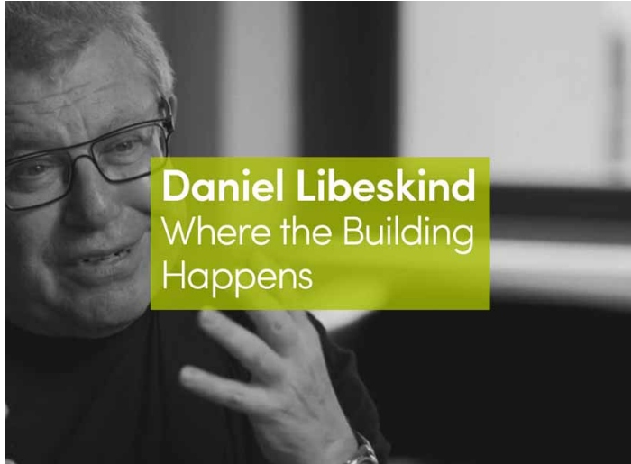
Daniel Libeskind Where the Building Happens