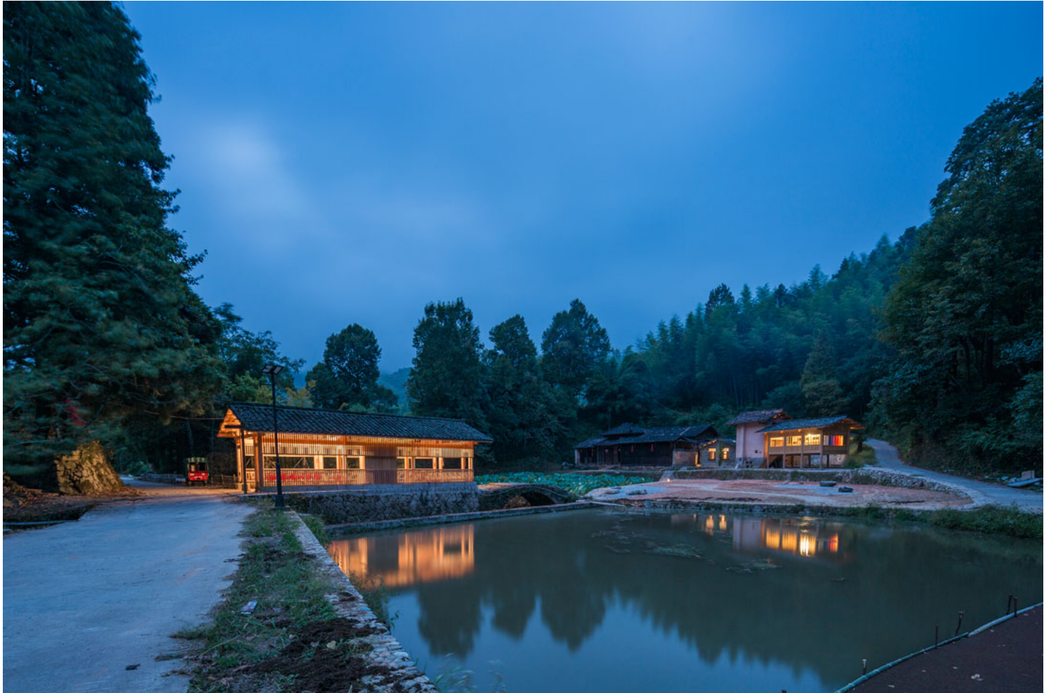
Panorama view of Shuikou area in Shangping Village