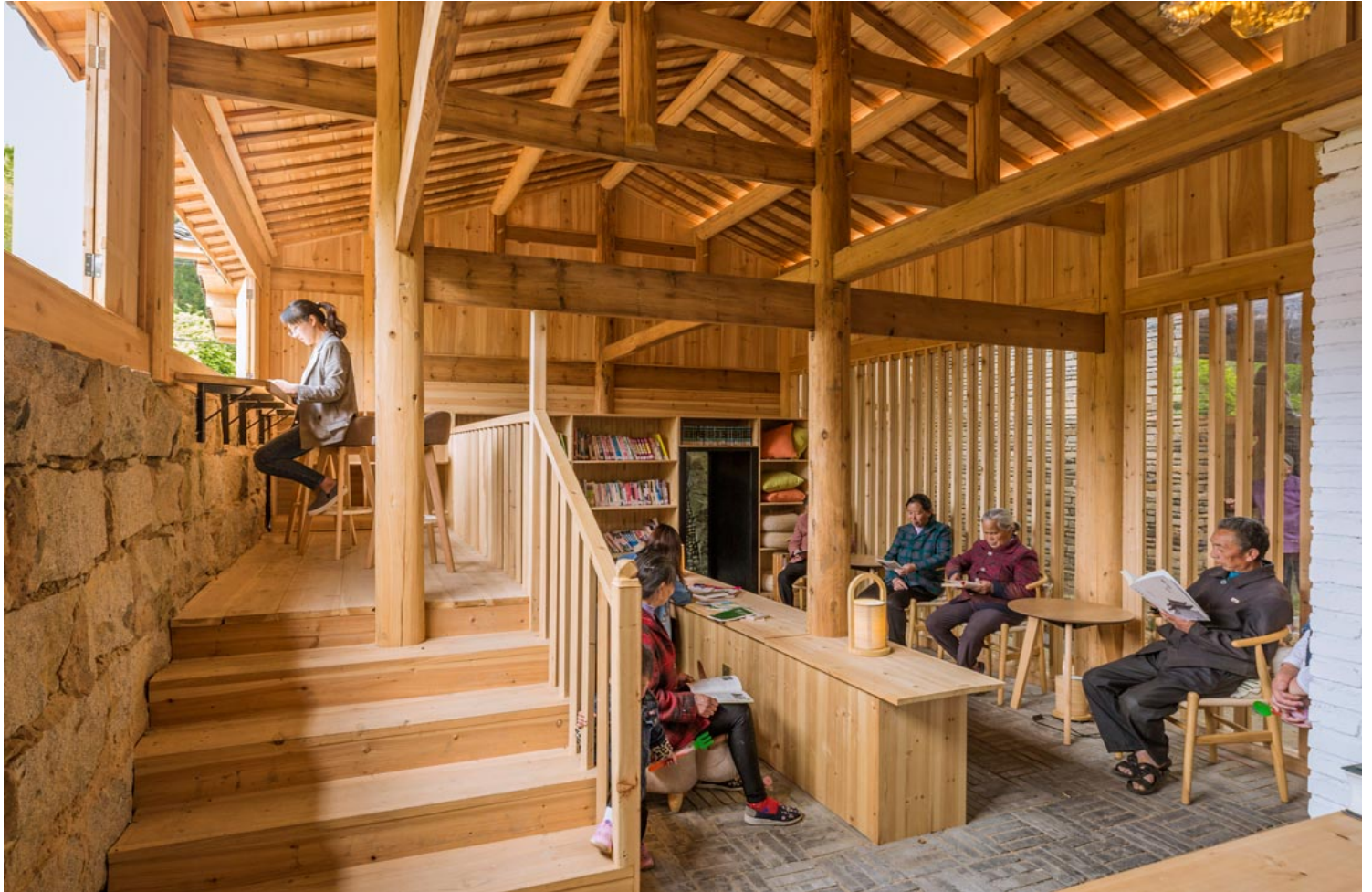
Local residents reading in Guang-Yue rural bookstore

Shangping Village Regeneration: a Cultural Heritage Area https://urbannext.net/shangping-village-regeneration/