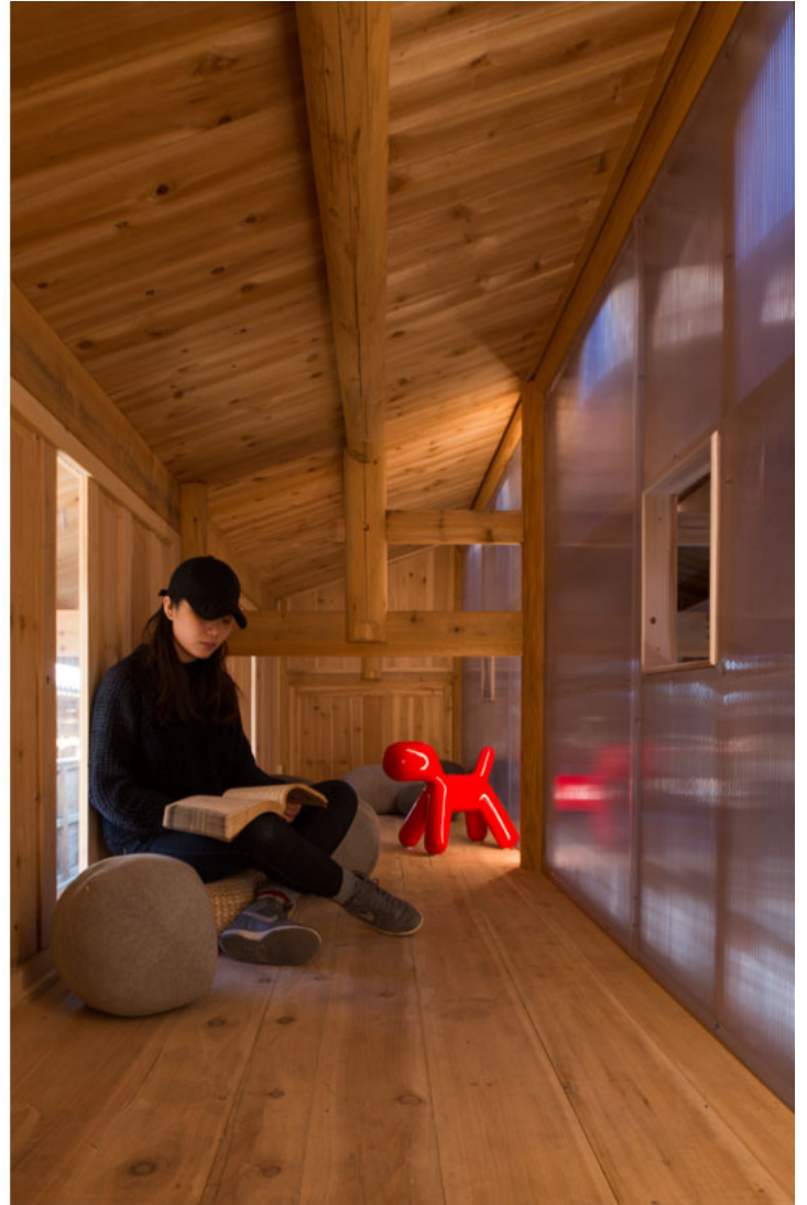
Interiors of the bookstore © Zhou Meng