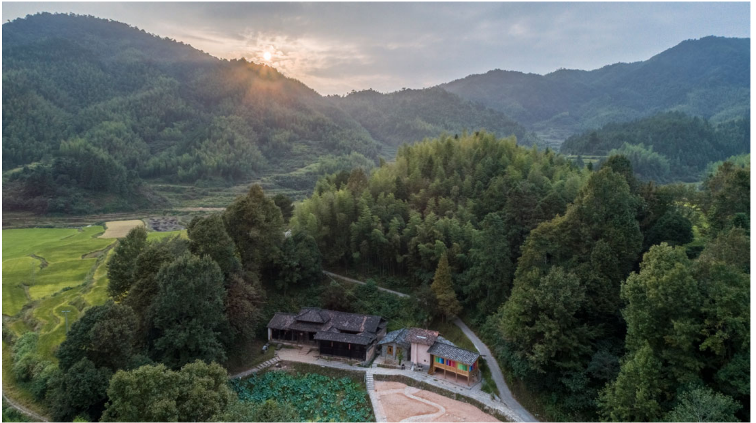
View of Shuikou area

mode of vernacular bed & breakfast. On the contrary, the design team has selected and transformed a number of abandoned agricultural facilities and infrastructures, such as cowsheds, pigsties, barns, and bamboo shoot squeezers, implanting upgraded industries, complementing tourism service facilities and providing a new economical platform. Based on the principles of locality and contemporariness, the design team has also designed cultural and creative products and has provided business guidance and promotions, which could be described as an integral service from conceptual planning to spatial construction and the provision of tourism products and promotion.