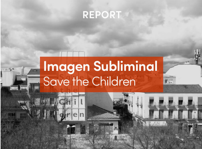
Imagen Subliminal Save the Children