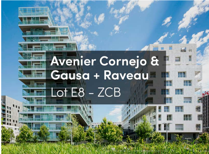
Avenier Cornejo & Gausa + Raveau Lot E8 - ZCB