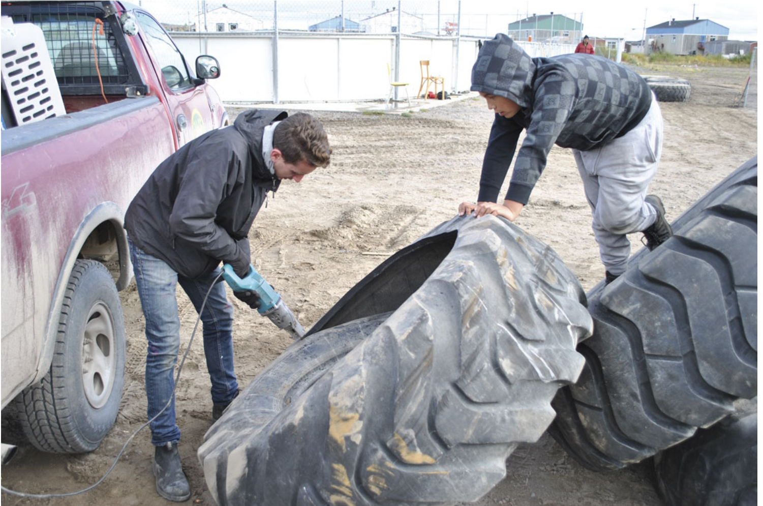
Modifying tractor tires for the base of the light beacon. Kuujuuaq, QC, 2017