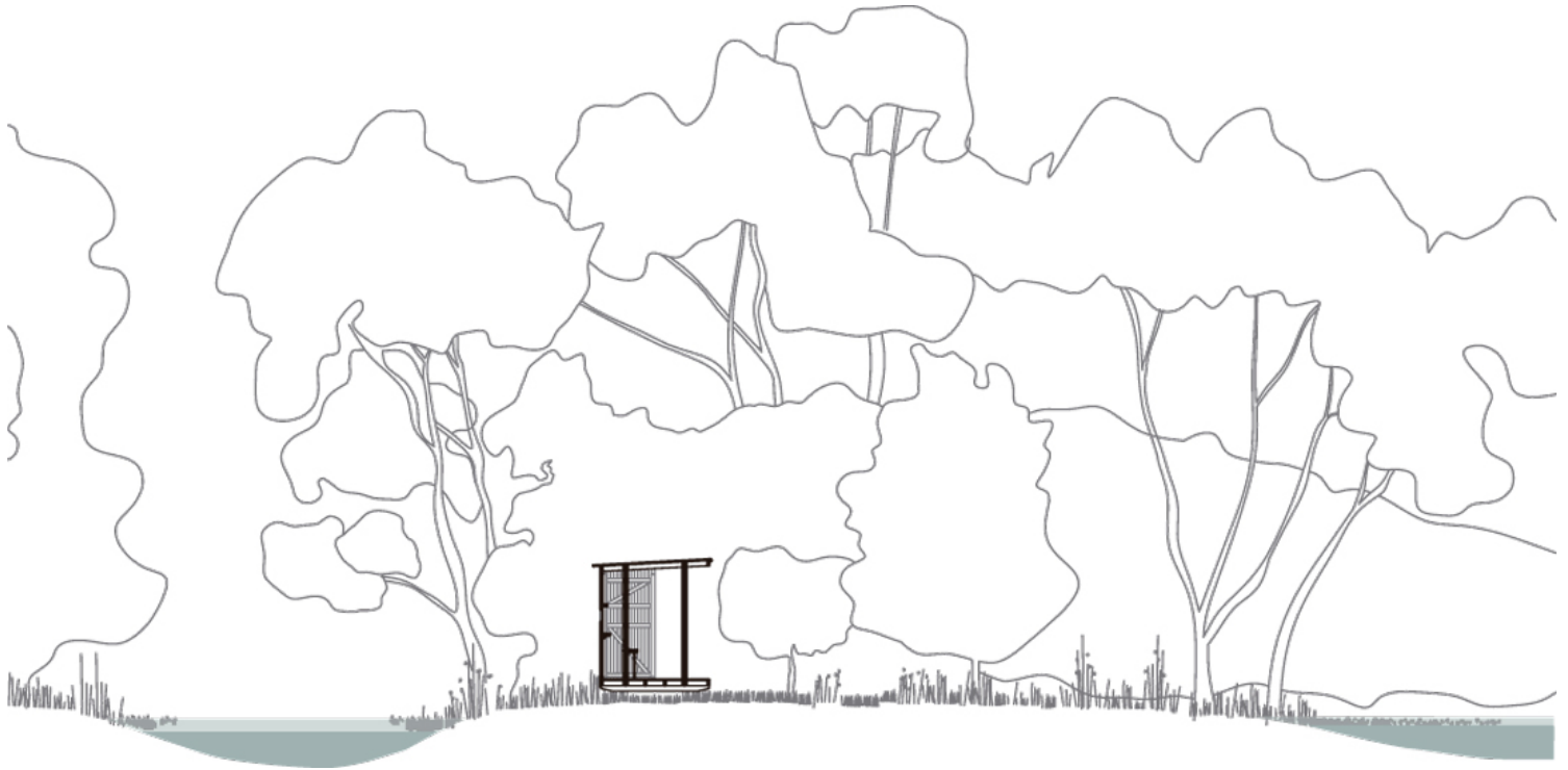
Bird hide section.

How we engage with the natural environment changes how we value it.