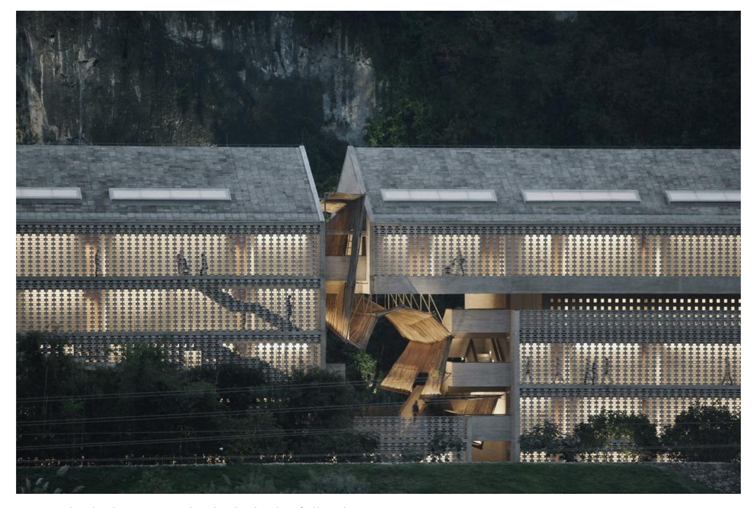
Our main design strategies include the following: