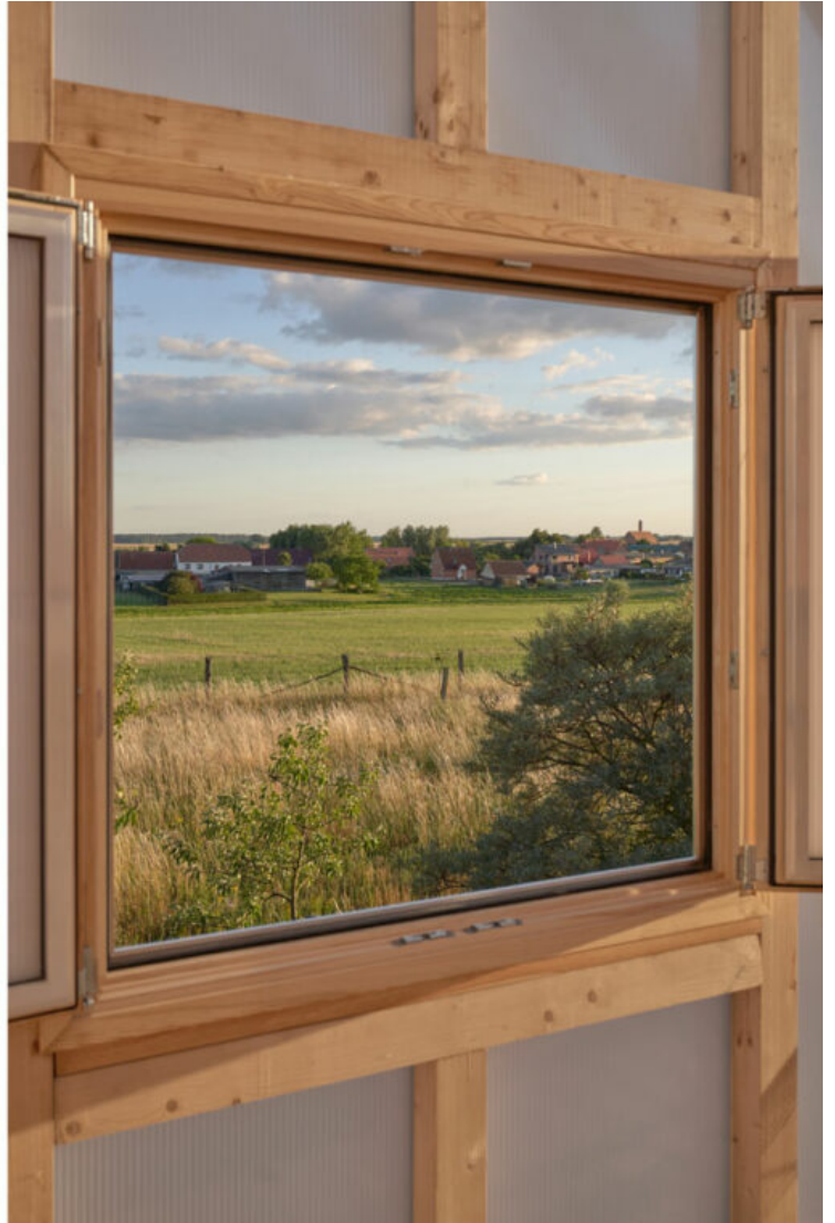
Sigurd Larsen Architect GlasHaus