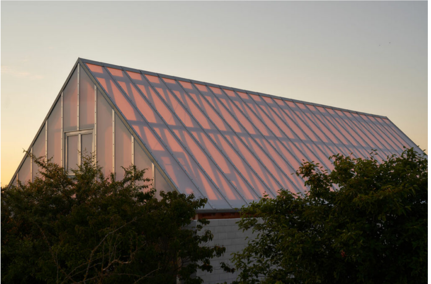
Sigurd Larsen Architect GlasHaus

Das Glashaus: A Seamless Retreat in the Uckermark Countryside https://urbannext.net/das-glashaus/