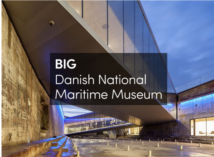
BIG Danish National Maritime Museum