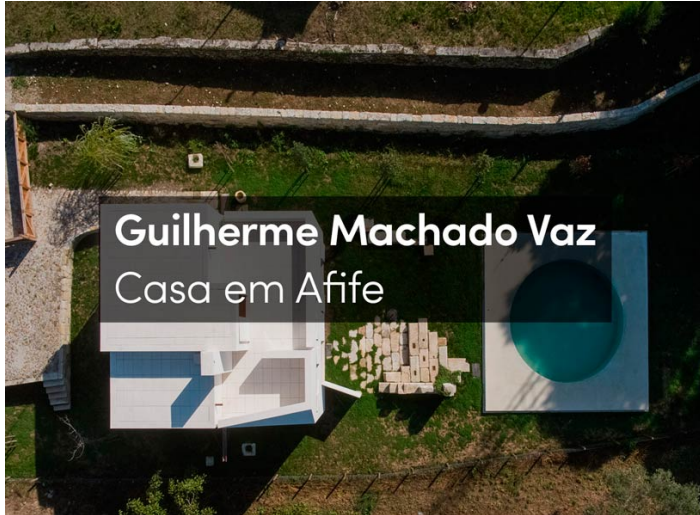
Guilherme Machado Vaz Casa em Afife