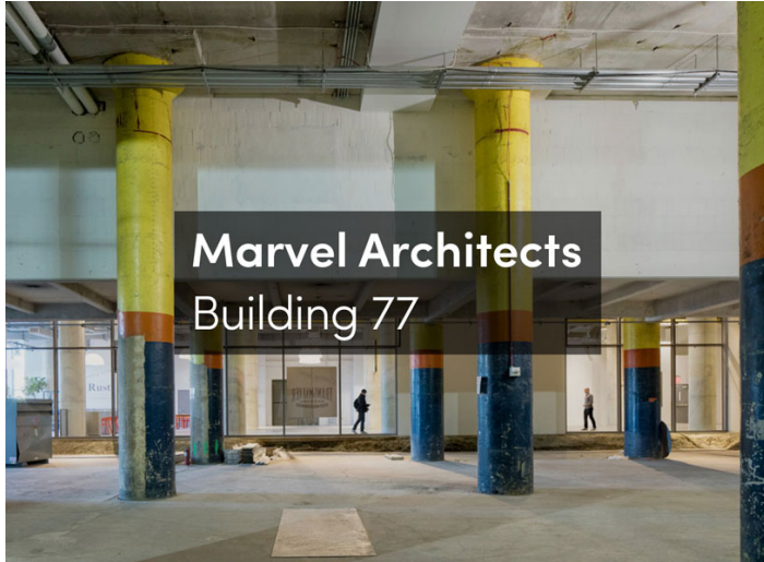
Marvel Architects Building 77