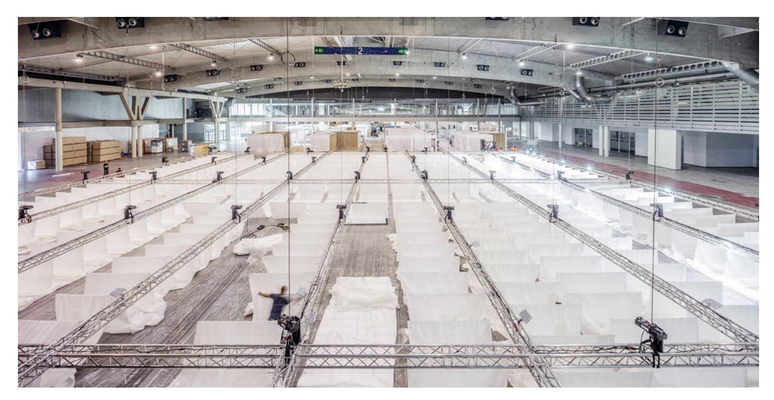
In short, it is an original ephemeral architecture that is committed to the planet and materializes the historic language of construction and, therefore, of architecture.