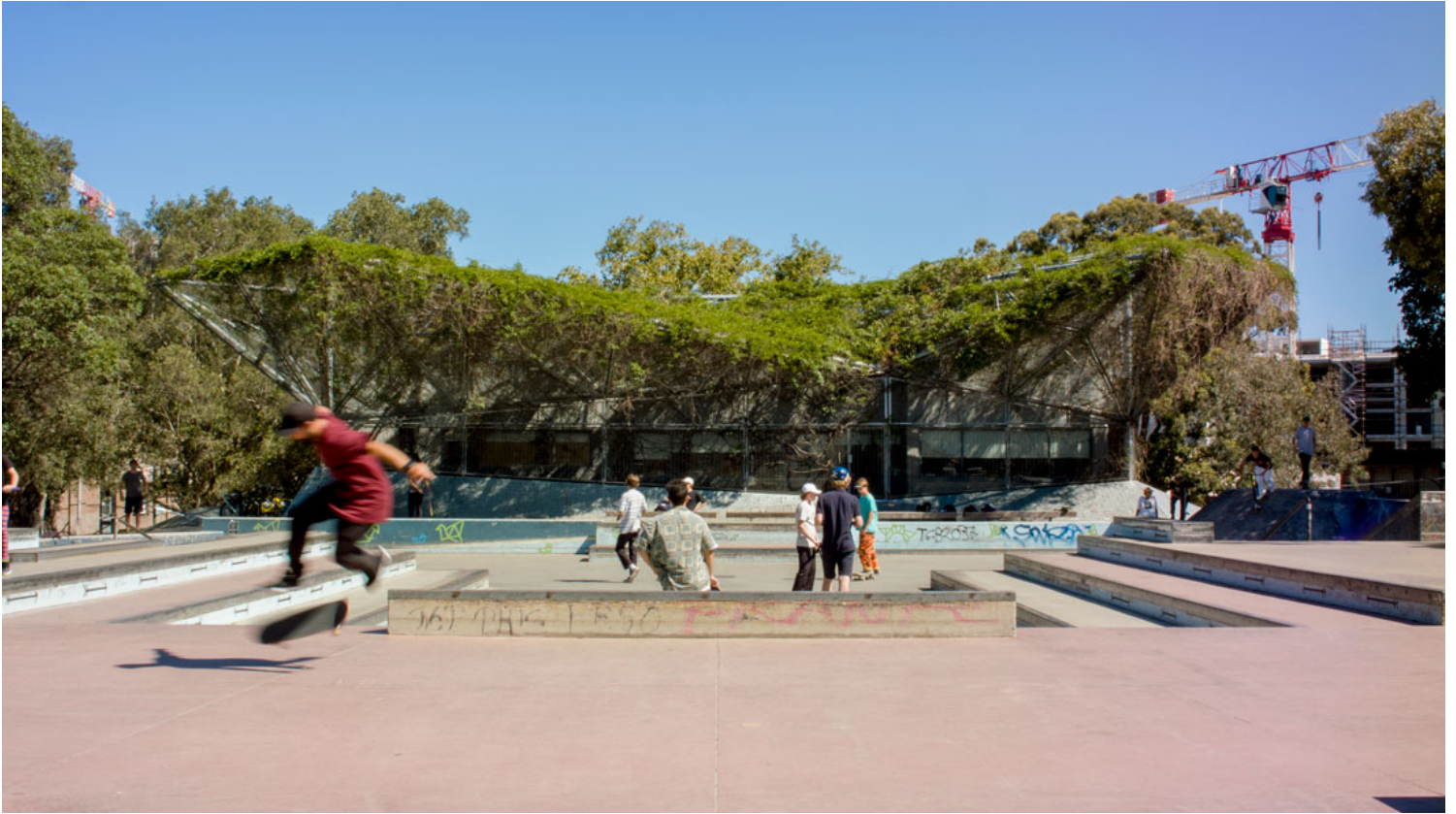
Ground.

rather than something for humans at all.