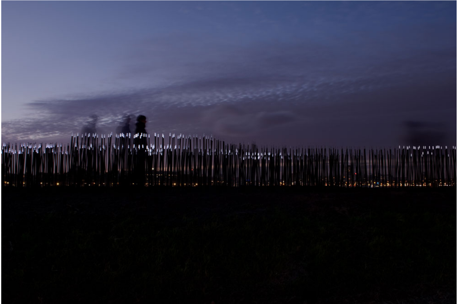
Dune 4.2. Maas River