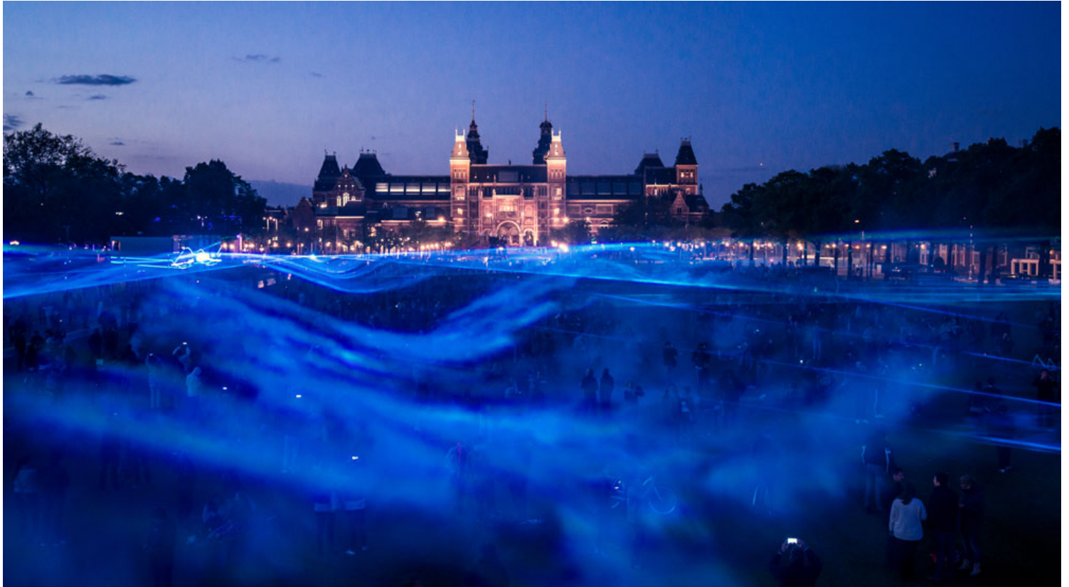
Waterlicht at Museumplein Amsterdam, The Netherlands.