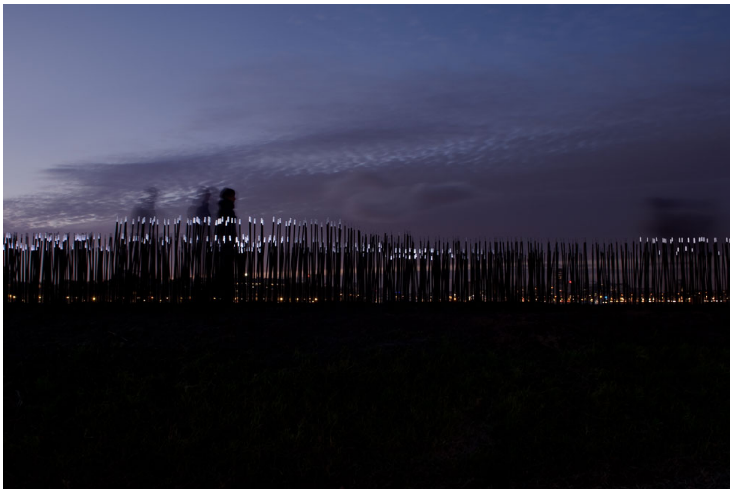
Dune 4.2. Maas River