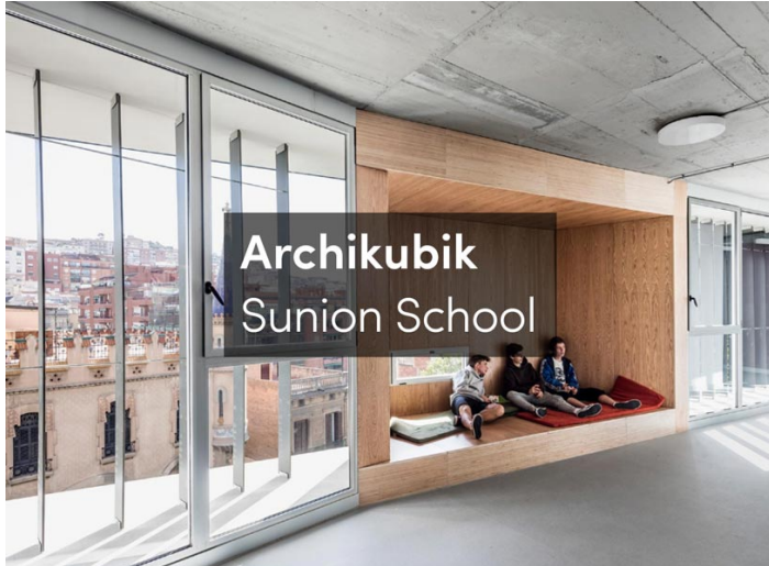
Archikubik Sunion School