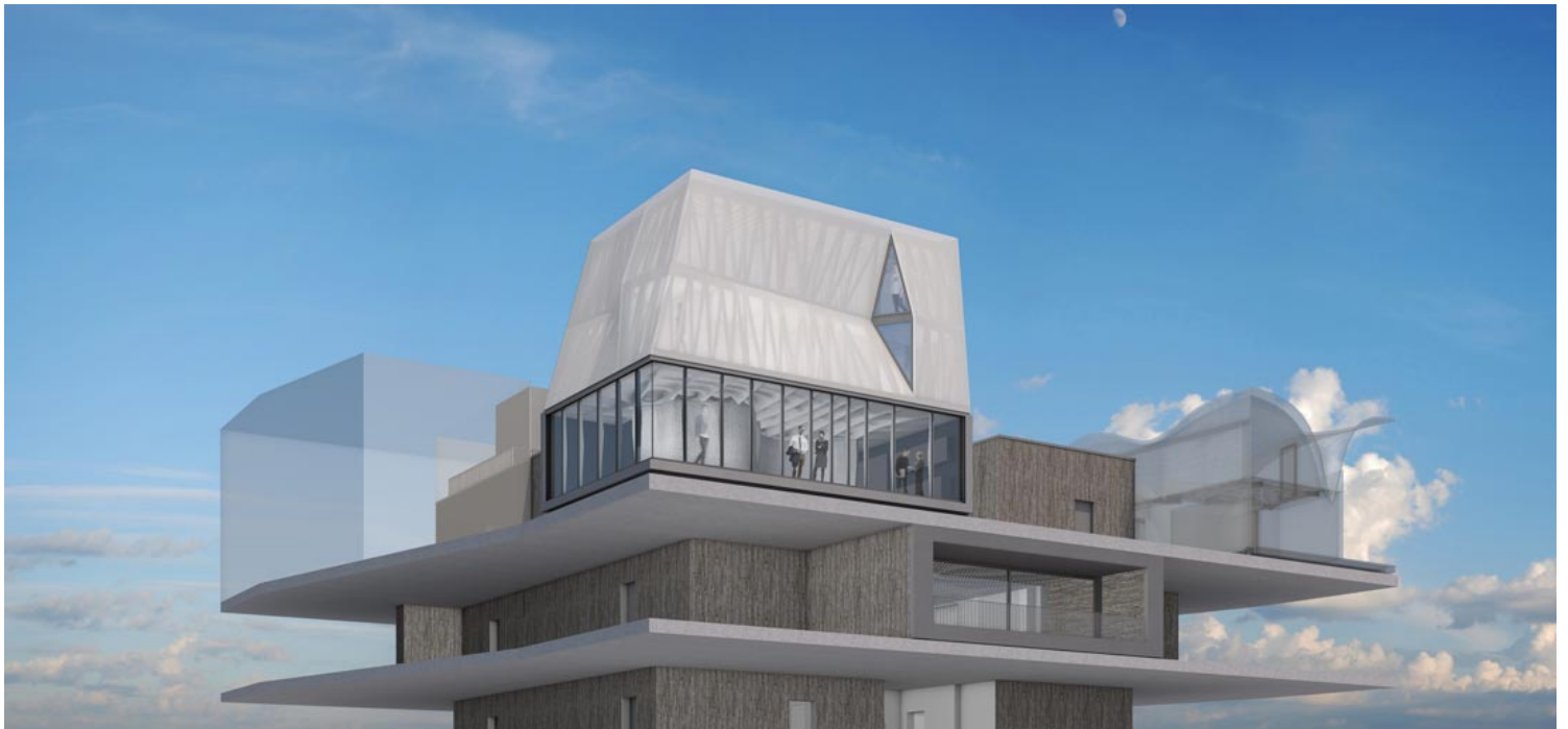
Computer generated visualisation of the DFAB HOUSE on the modular research and innovation building NEST of

Eight ETH Zurich professors are working together with industrial partners to build DFAB HOUSE, a three-storey residential unit that is part of Empa and Eawag's NEST research and innovation platform in Dübendorf. The fabrication of the mesh mould wall in May 2017 was the starting shot for the world's first building to combine multiple innovative digital construction processes under a single roof. Since then, two other digitally designed and fabricated building components were made ready for production and coordinated digitally within the overall project. The automated Smart Dynamic Casting coordination system has already been used at ETH to prefabricate concrete façade posts designed specifically for the loading conditions of the building's glass façade. A so-called "smart slab", a statically optimized concrete floor slab, is currently in pre-production. Researchers are using large-format 3D sand printing for its formwork. By bringing these elements together with Spatial Timber Assemblies, a unique combination will be materialising at DFAB HOUSE – which will open in autumn 2018.