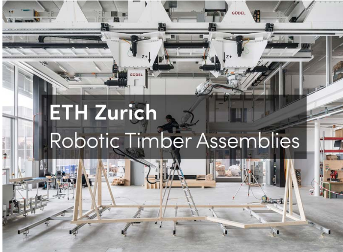
ETH Zurich Robotic Timber Assemblies