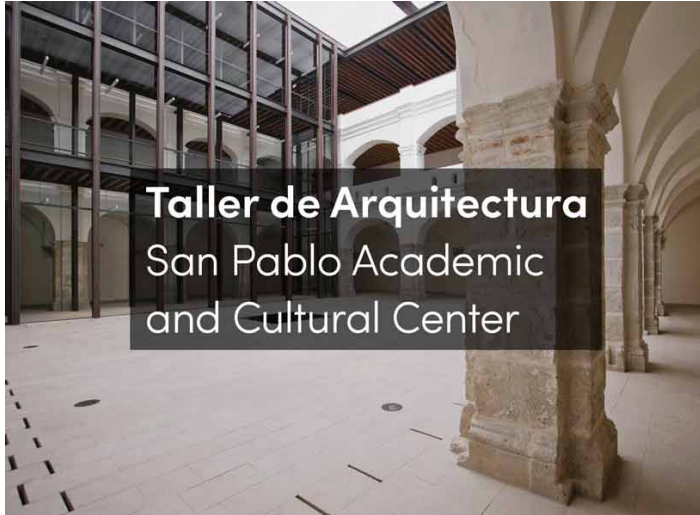
Taller de Arquitectura San Pablo Academic and Cultural Center