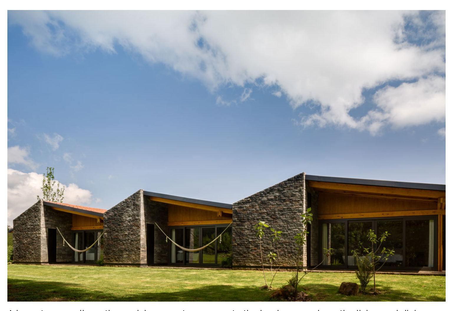
A large terrace allows the social spaces to open up to the landscape, where the living and dining areas have views to both the open surroundings and the central patio.