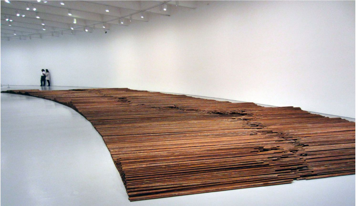
"Straight," 38 tons of steel rebar from schoolhouses that collapsed in an 2008 Sichuan earthquake.

2008 was also the year in which Beijing held the Olympic Games and you collaborated with Herzog & de Meuron on the stadium design. What was your aim with your contribution to that work?