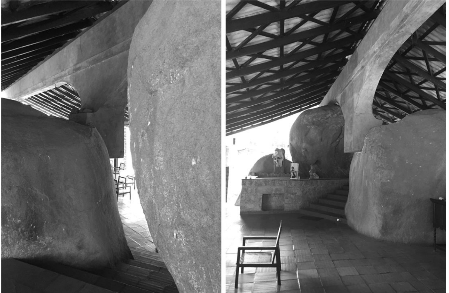
Left: The entry and living space of Geoffrey Bawa's Polontalawa Estate Bungalow.