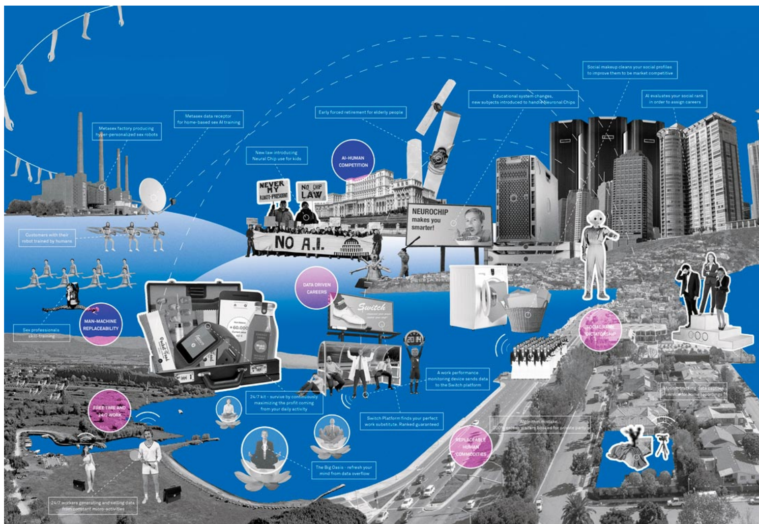
Nefula, The Futures of Work , map, 2017.

On Automation and Free Time https://urbannext.net/on-automation-and-free-time-2/