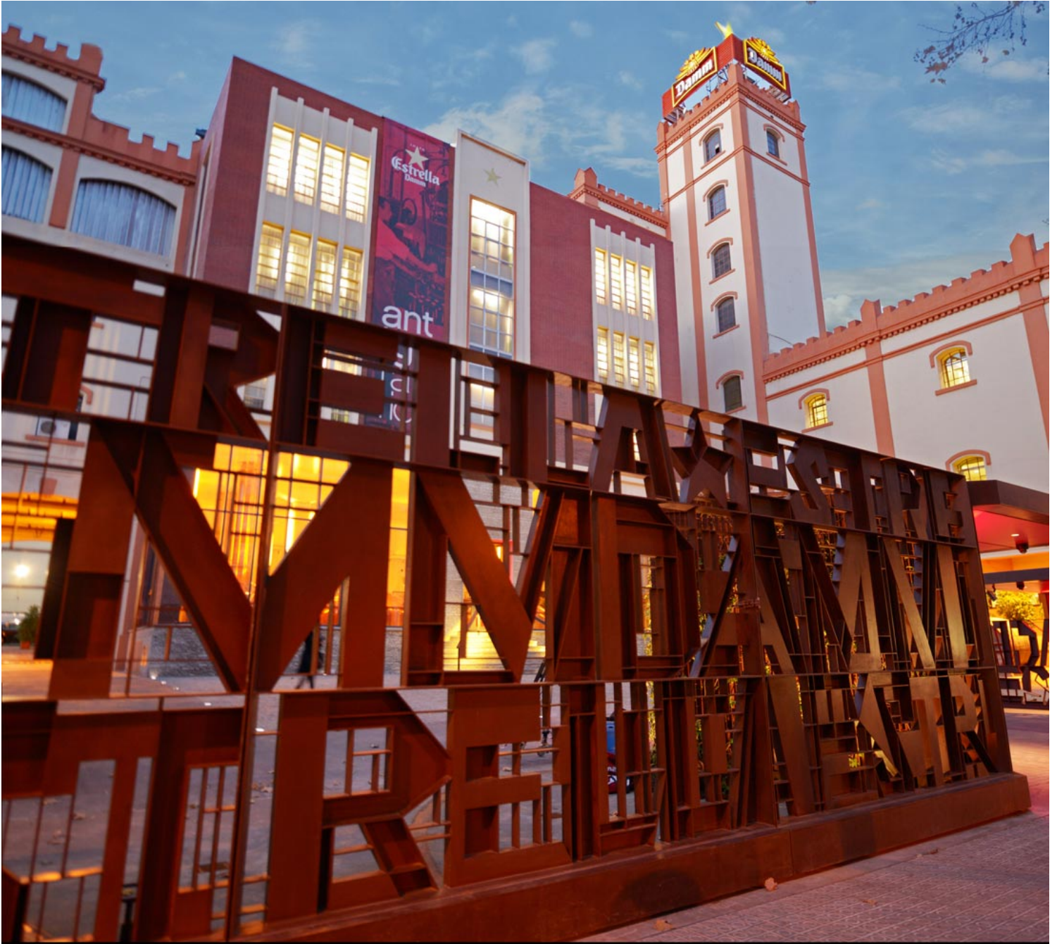
The building corresponds to the classic industrial typology of the time: the façades combine stucco