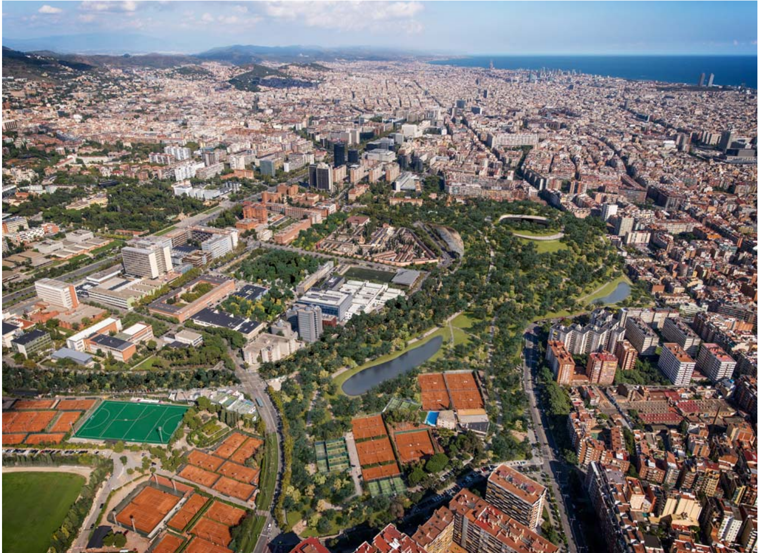
Aerial view of the Camp Nou renaturation proposal. Project by ON-A Architecture. © ON-A