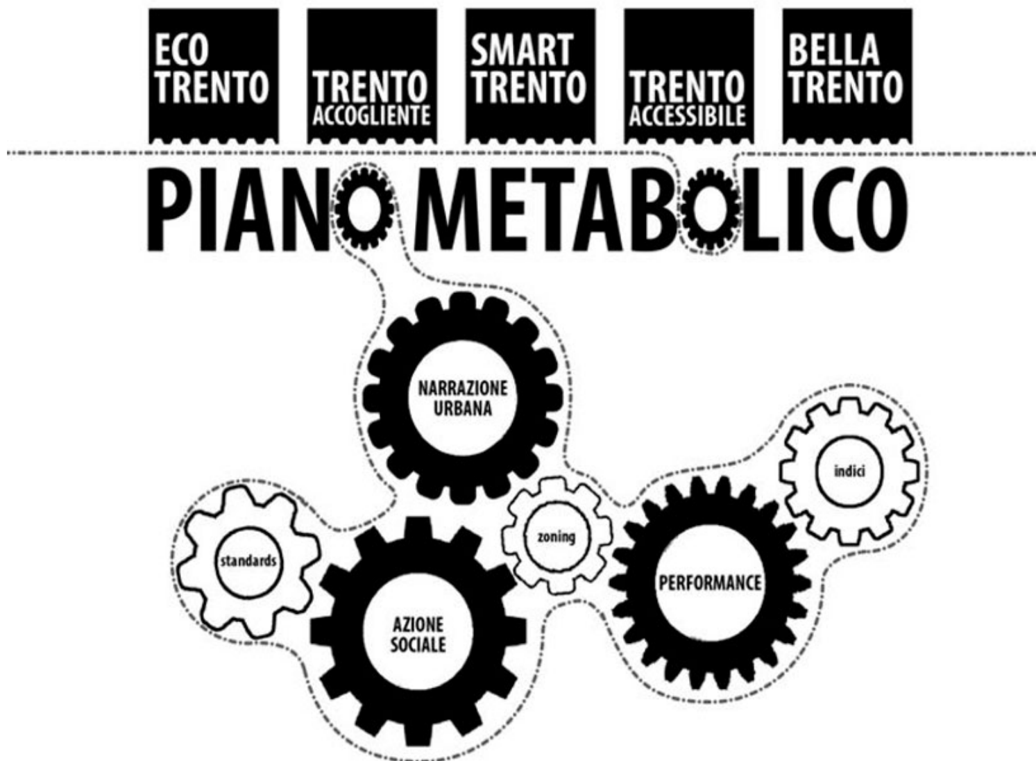
Fig. 02 The five challenges

In line with the themes outlined by the European Urban Agenda, Environment, Society, Demography, Mobility, Economy (UN, 2016), the plan proposes five challenges for the future and development of Trento. The challenges include short-term and long-term objectives, but unlike