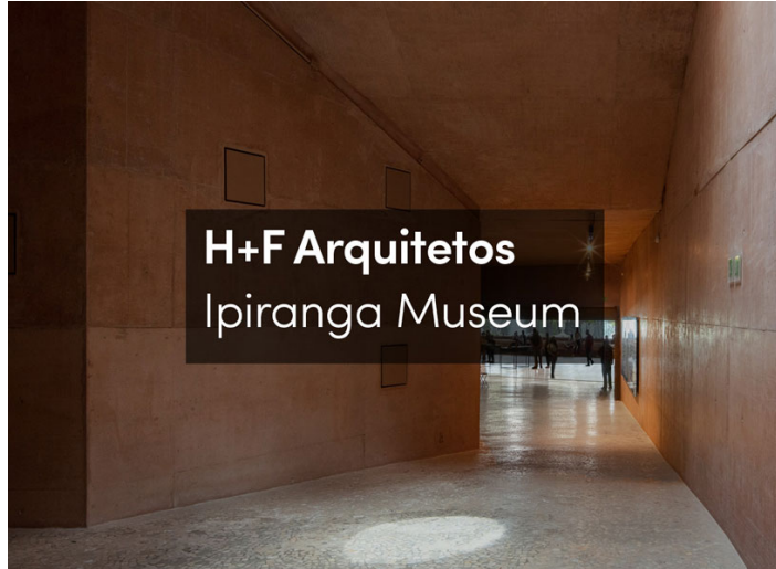
H+F Arquitetos Ipiranga Museum