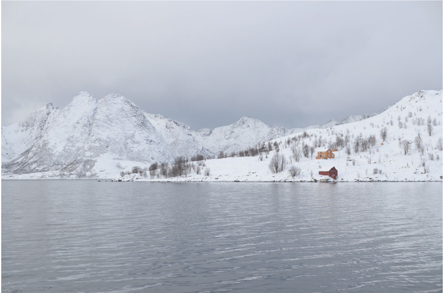
Jarbakkan, Tindsøya, Øksnes Vestbygd