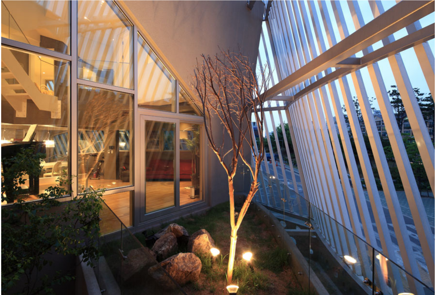
Eco-screen Facade - Filter for summer sunlight, noise, privacy and security