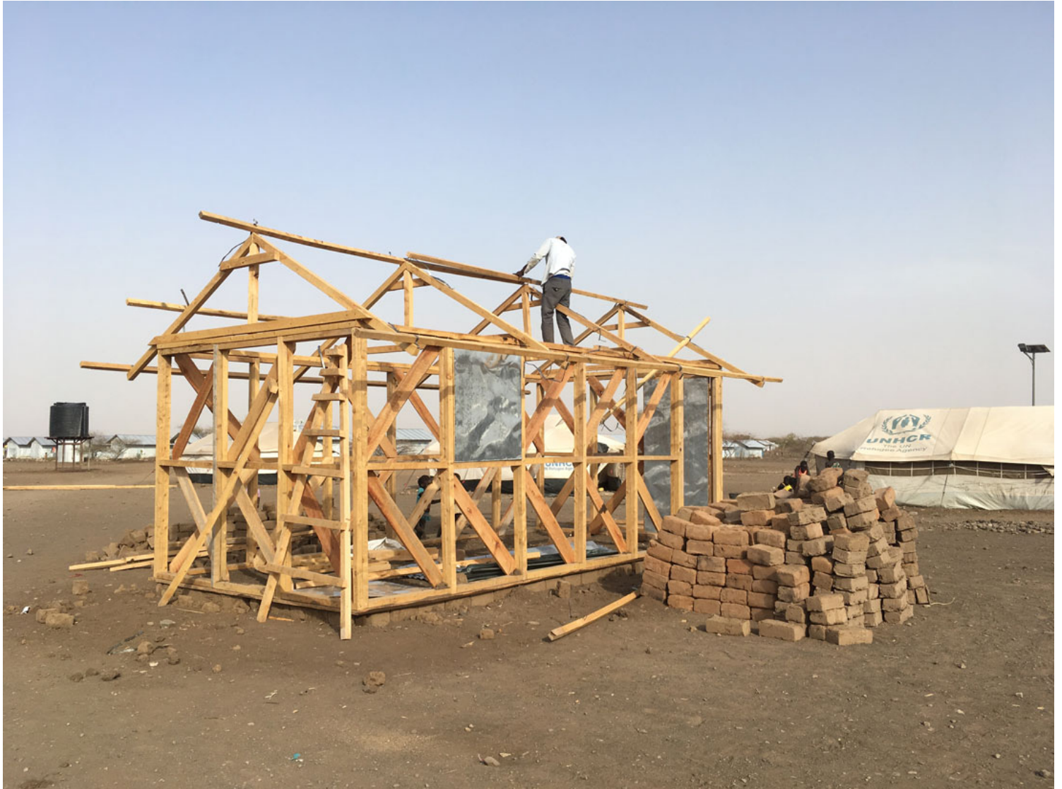
Completion of Timber Framework

Kalobeyei Settlement: Urban Planning for a Refugee Camp https://urbannext.net/kalobeyei-settlement/