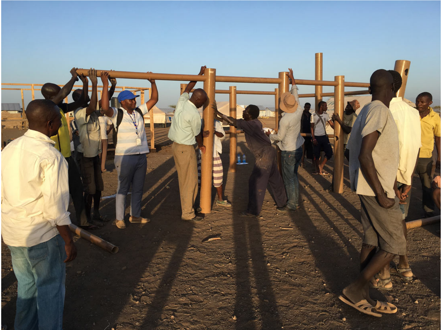
Assembly of Paper Tube Columns and Beams

Kalobeyei Settlement: Urban Planning for a Refugee Camp https://urbannext.net/kalobeyei-settlement/