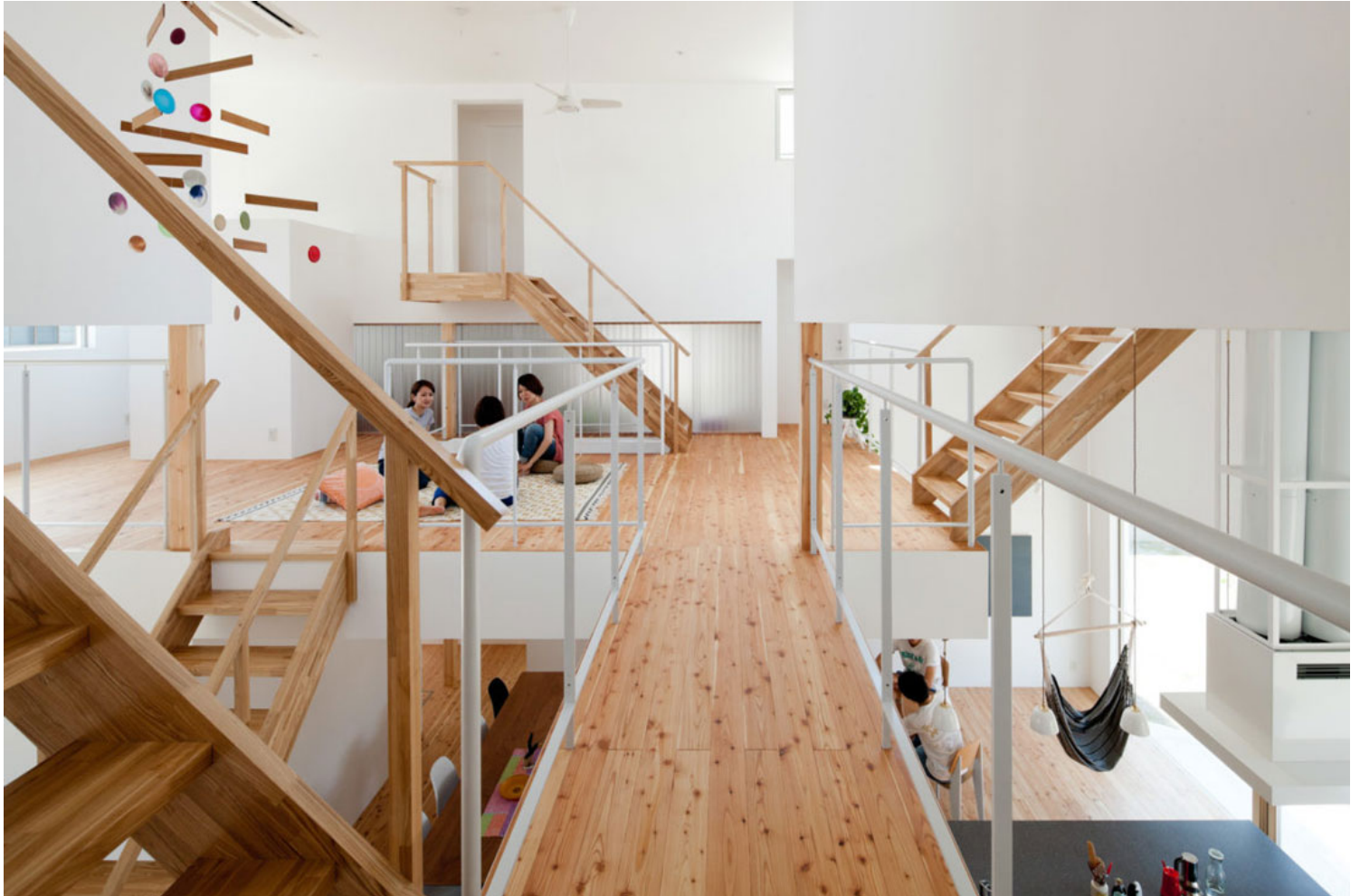
Share House LT Josai, Naruse Inokuma Architects.

Is shared living a new luxury? https://urbannext.net/is-shared-living-a-new-luxury/