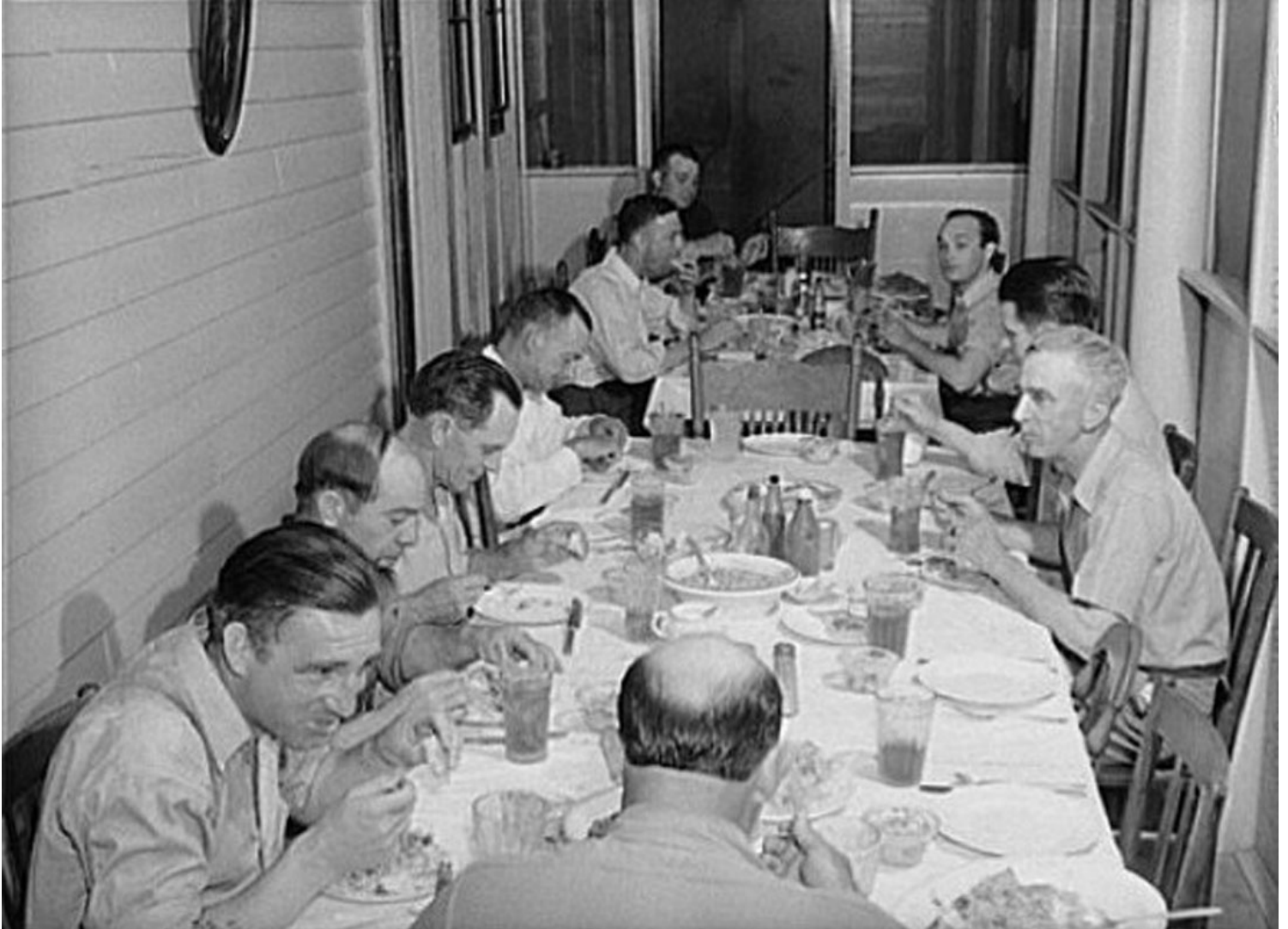
Workers from and Alabama Munitions Plant eating dinner at their boarding house, 1941.

Is shared living a new luxury? https://urbannext.net/is-shared-living-a-new-luxury/