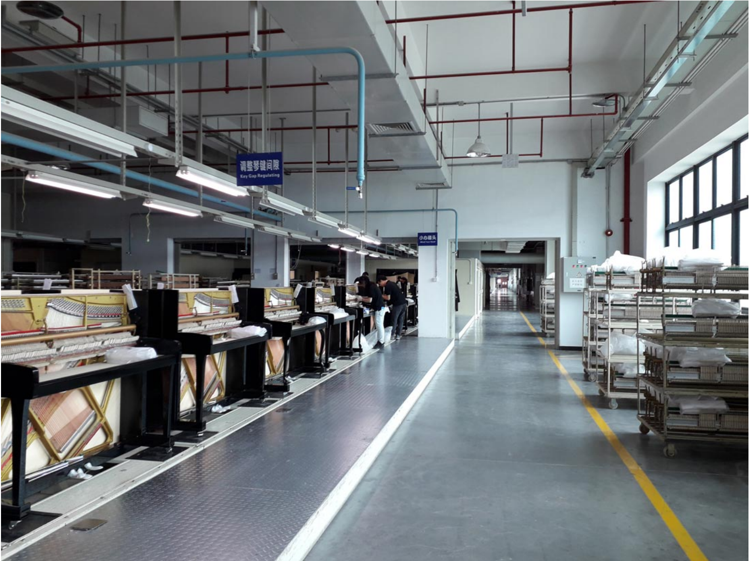
The Grand Piano manufacturing area of Pearl River Piano Group Ltd in Zengcheng Development Zone

https://urbannext.net/industrial-clusterization/