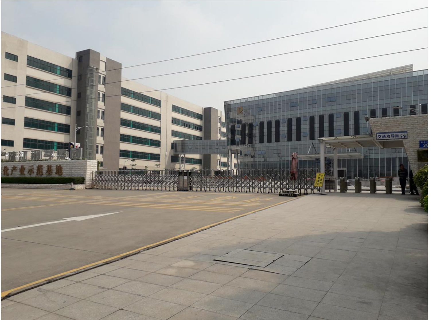
The new plant for the Pearl River Piano Group Ltd in Zengcheng Development Zone

https://urbannext.net/industrial-clusterization/