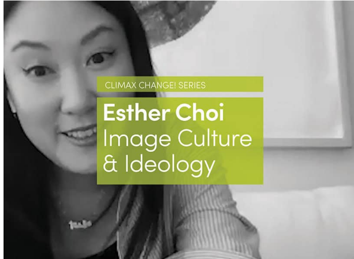
IMAGE CULTURE & IDEOLOGY