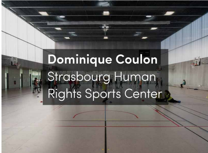
Dominique Coulon Strasbourg Human Rights Sports Center