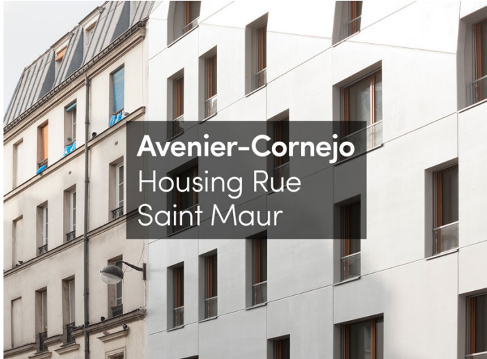
Avenier-Cornejo Housing Rue Saint Maur