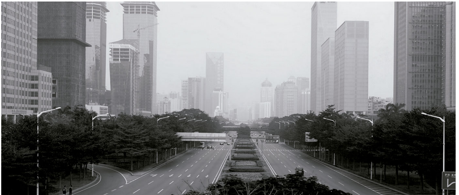
Shennan Road, Shenzhen.

Contemporary cities never start nor end; rather, they continuously adapt, mitigate, and mutate to remain relevant, expanding and contracting to survive. Several hundred million more people are expected to move to cities in East Asia over the next twenty years as economies shift from agriculture and manufacturing to services. When China's Pearl River Delta has overtaken Tokyo to become the world's largest urban area in both size and population, Hong Kong (HK) and Shenzhen (SZ) are in a strategic position, both geographically and politically, to examine the role of what our cities are, rather than what they might become.