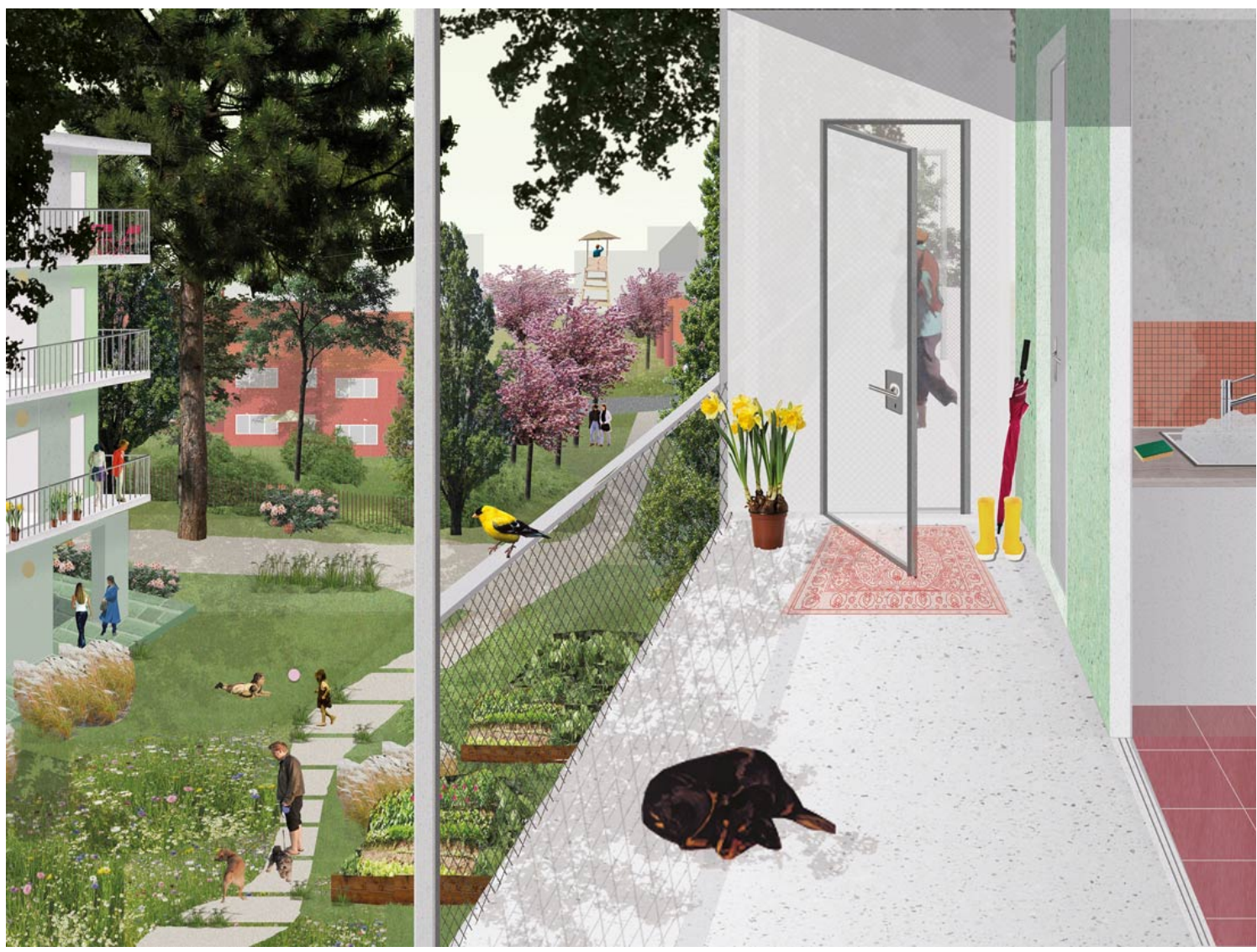
Our project reinterprets the current garden city based on a shared landscape and the feeling of belonging to the Homborch community. Through a participatory process, we aimed to achieve the integration of both existing and new inhabitants and users in order to create a sustainable and inspiring living environment where all residents feel at home.