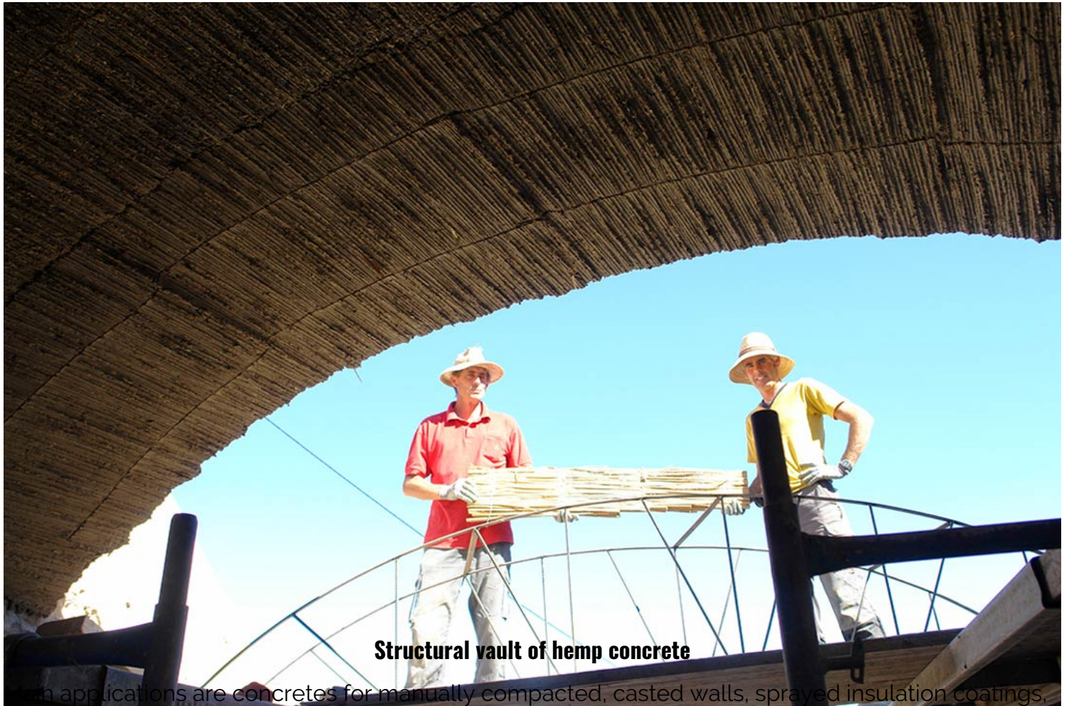
Structural vault of hemp concrete

Common applications are concretes for manually compacted, casted walls, sprayed insulation coatings, external and internal plasters, premade blocks and panels for non load-bearing or load-bearing applications, floor slabs, slabs and roof insulation, including structural applications like vaults and cupolas. Densities of this concretes start with 200-250 kg/m 3 (sprayed coatings or void filler), while a wall mixture for non load-bearing applications ranges usually from 400-500 kg/m 3 . Whereas hemp consumption is unchanged, higher densities of 600 kg-1000 kg are achieved, among other methods, with higher binder content what increases the mechanical strength. Those concretes and mortars are used in plasters, external renders and load-bearing applications. For environmental and economic reasons non calcined binders, e.g. clay based ones, are preferable in load-bearing