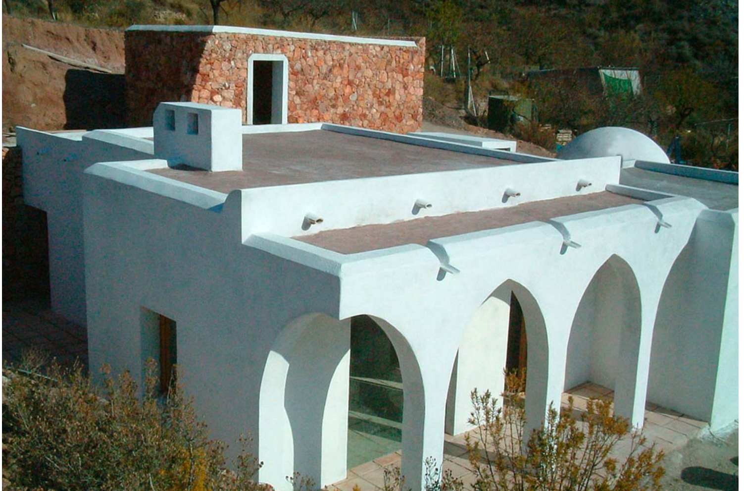
External view of a finished hemp clay brick

important knowledge to manage the performance of this innovative system, approaching optimum results and durability, required for its present and future applications.