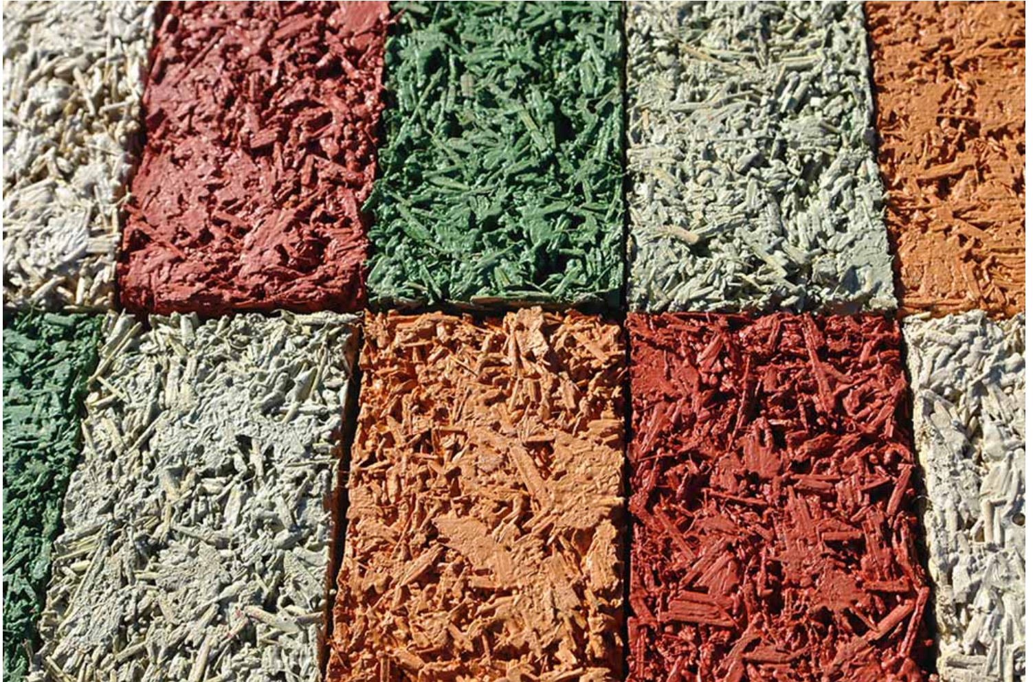
Natural and colored hemp lime concrete samples