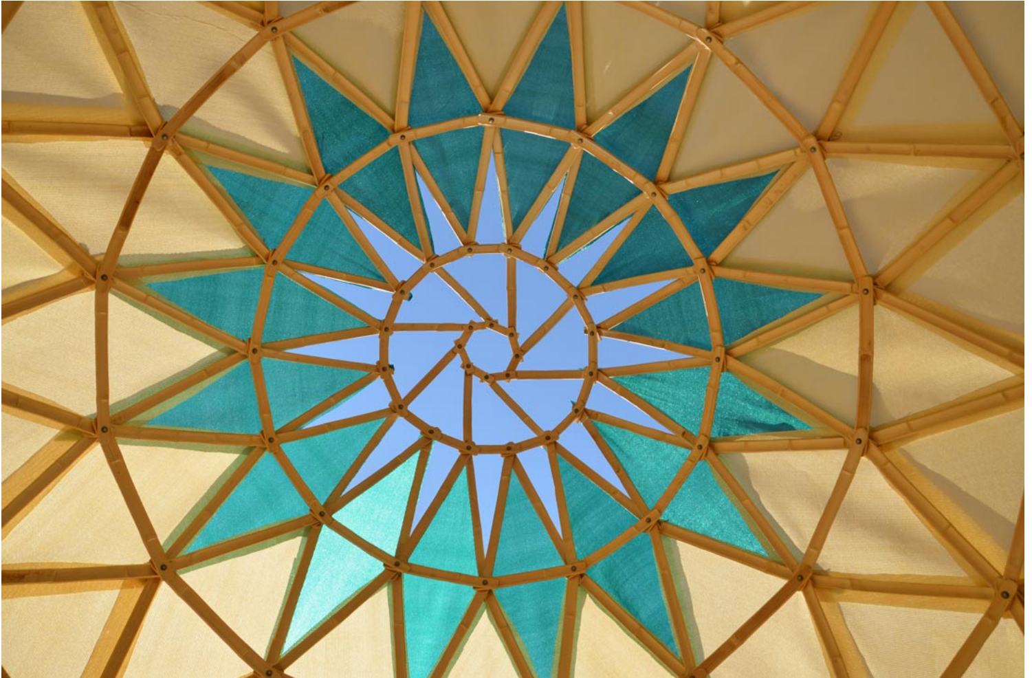
“Oca do Curumin” – Children’s area. Piracicaba. Brazil 2016

https://urbannext.net/geometric-for-the-people/