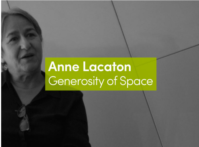
Anne Lacaton Generosity of Space