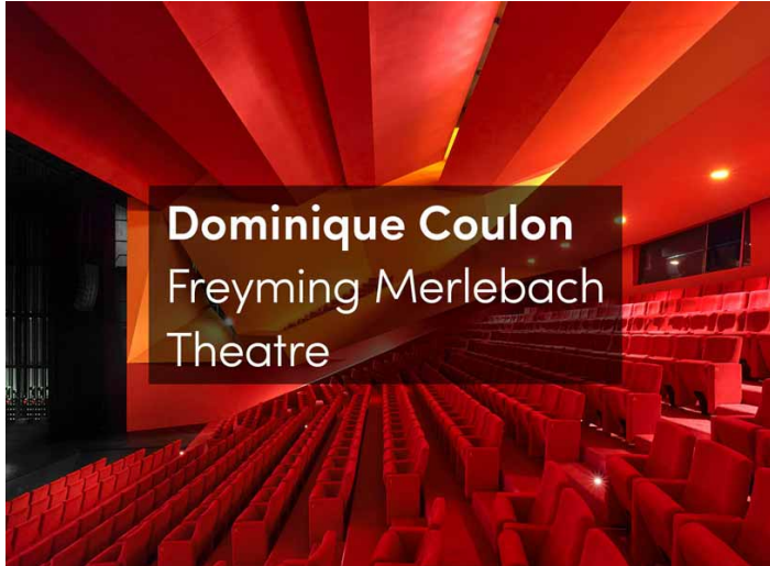
Dominique Coulon Freyming Merlebach Theatre